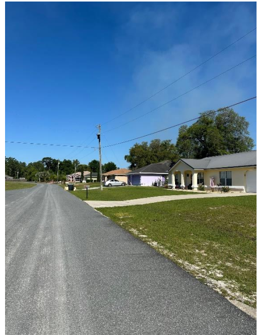
Looking down SW 22 nd Court Rd.