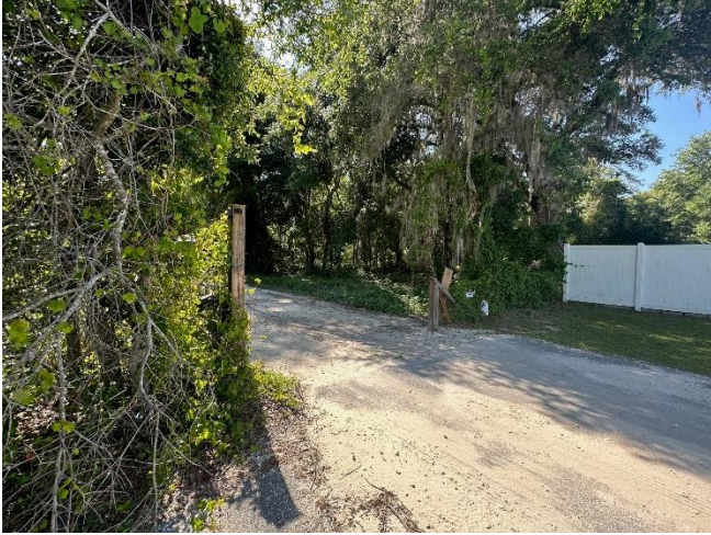
Entrance to subject property.