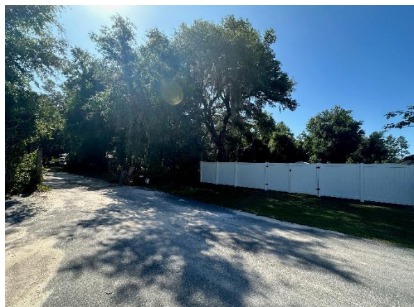
Entrance to subject property, and neighbor's fence, right.