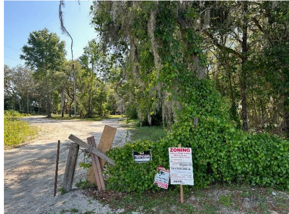
Subject Property from SW 22 nd Court Rd.