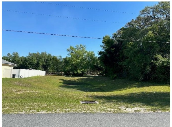
Water retention area on the north west border of subject property. Subject property border, right.