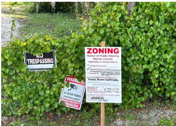
Subject property from SW 22 nd Court Rd.