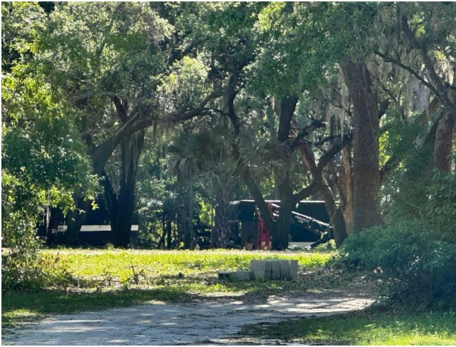
View from entrance of truck parking area.