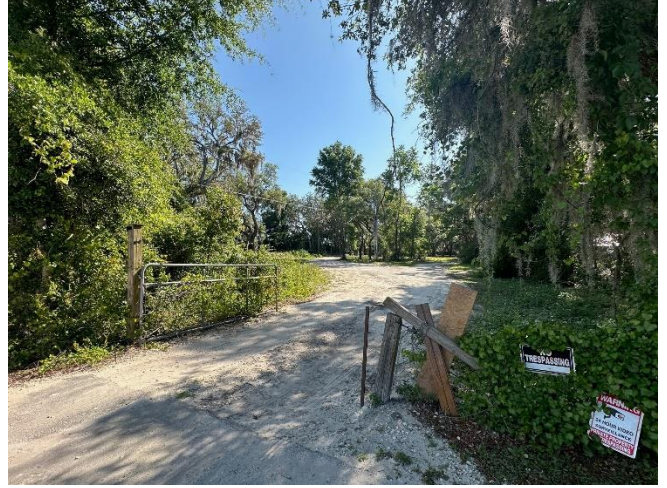
Entrance to subject property.