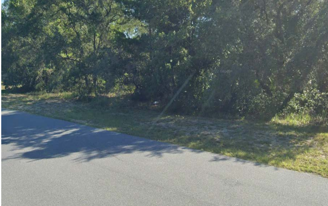
Southwestern corner of Proposed PUD (Also on SW 29 th Ave. Rd.)