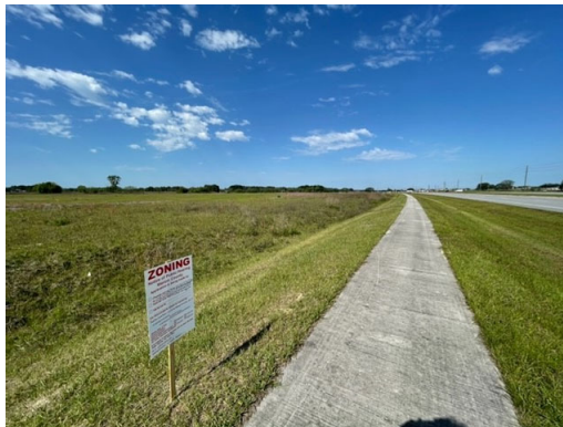
View of sign from north side of SE 92 nd Loop.