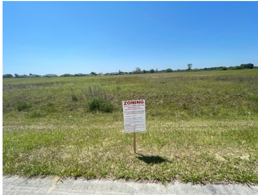
Close-up view south across site.