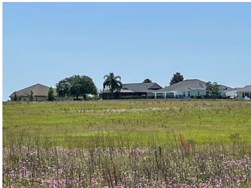
Close-up view southwest across site.