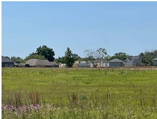
View west along SE 92 nd Loop.