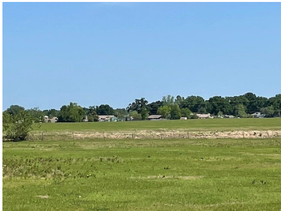
Enlarged view north/northeast across site.