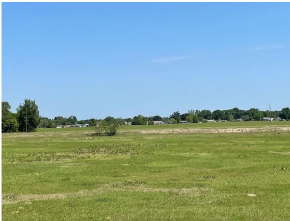
View north/northeast across site.