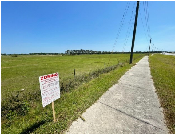
View east along SE 92 nd Loop.