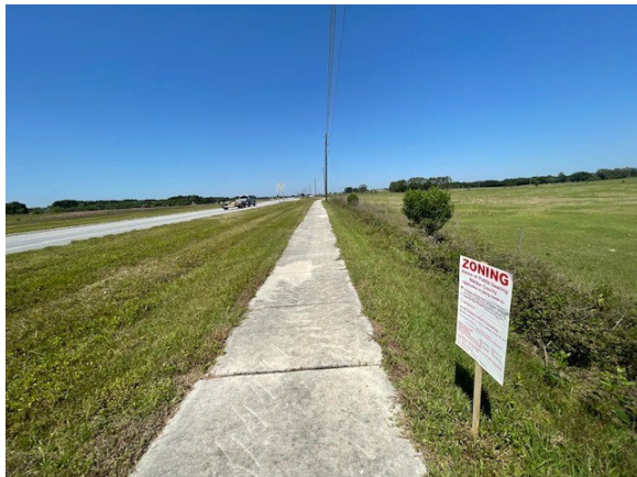
View west/northwest along SE 92 nd Loop.