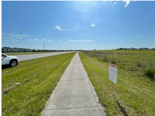
Close-up view southeast across site.