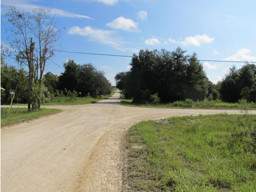
View from SW 30 th Street Rd to the East