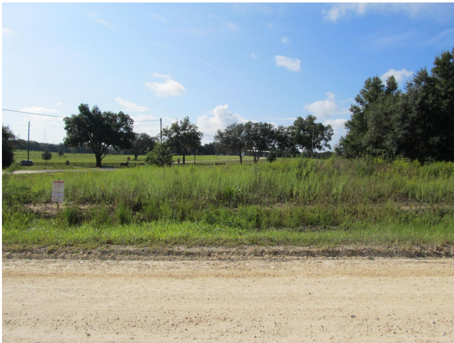
Looking South, View of the front Parcel with advertising on SW 30 th Street Rd