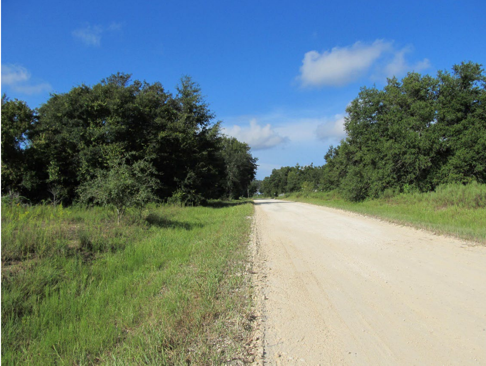
View from SW 30 th Lane to the West