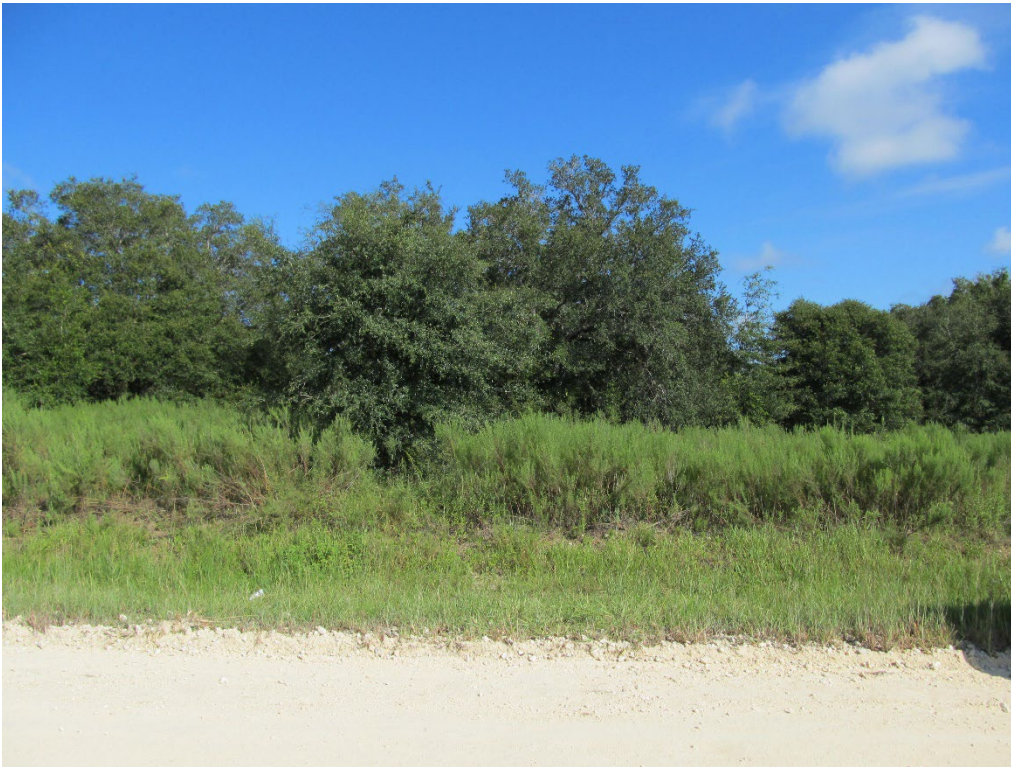
View from SW 30 th Street Rd to the North