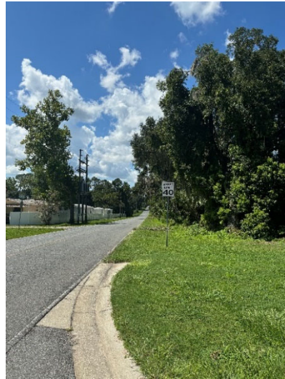
3. Views from Adena G&CC golf course maintenance facility access at N. US 441, looking east, south, west, and north.