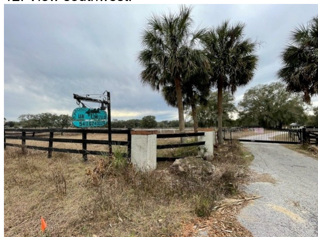
12. View southwest.