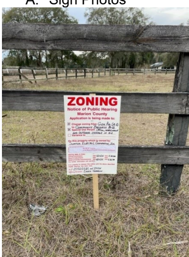
A. Sign Photos