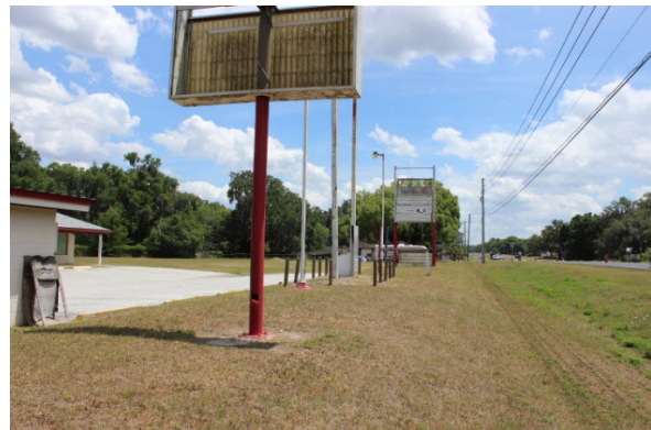
5. South onto N US HWY 441