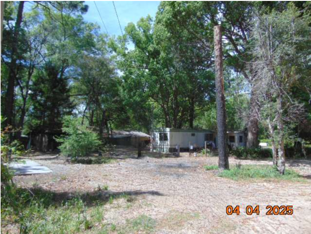
IMAGE DESCRIPTION 2:33 pm At 830 SE 159th Ter. Unsafe structure.