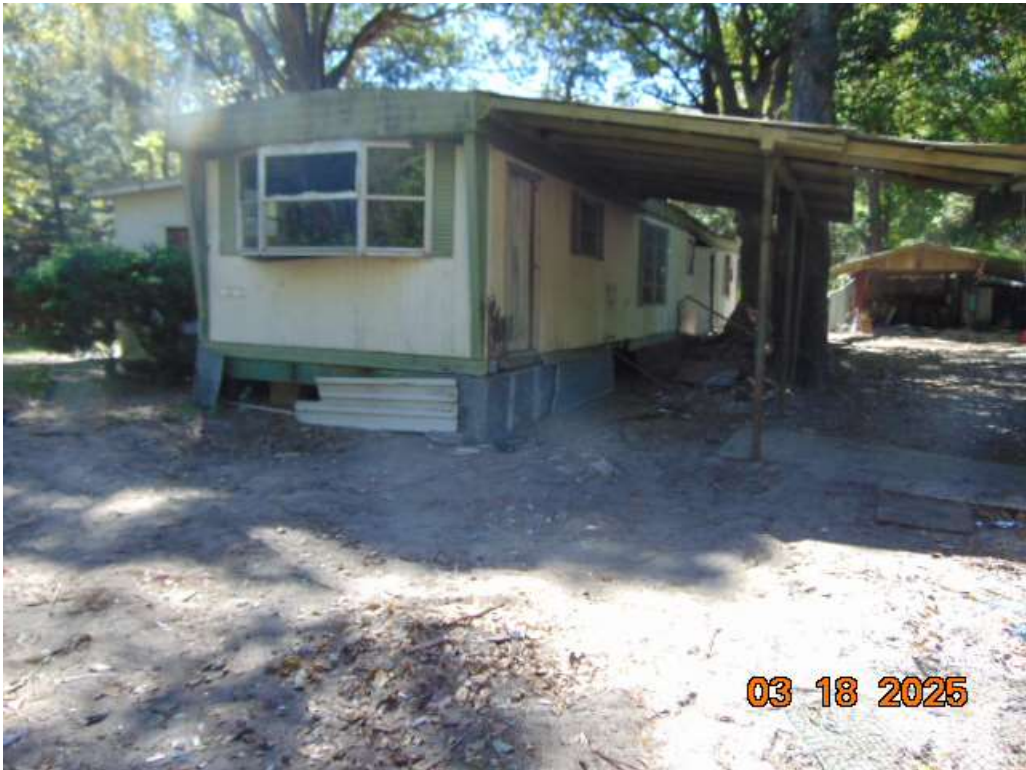
IMAGE DESCRIPTION 12:17 pm At 830 SE 159th Ter. Unsafe structure.