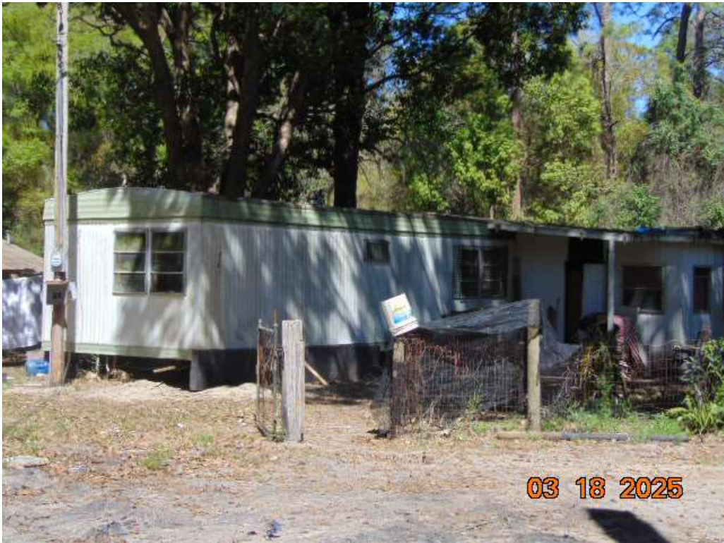
IMAGE DESCRIPTION 12:17 pm At 830 SE 159th Ter. Unsafe structure.