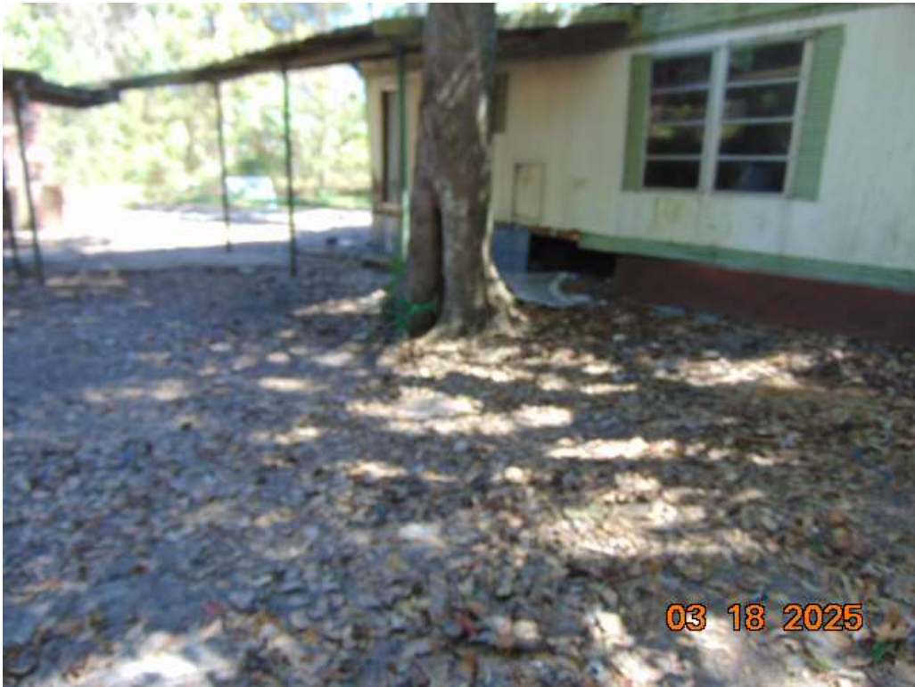
IMAGE DESCRIPTION 12:17 pm At 830 SE 159th Ter. Unsafe structure.