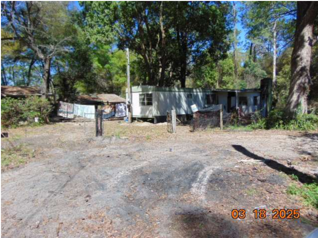
IMAGE DESCRIPTION 12:17 pm At 830 SE 159th Ter. Unsafe structure.