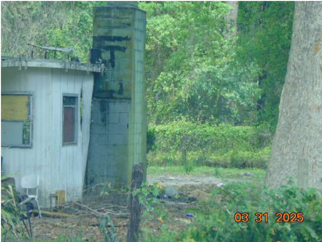
IMAGE DESCRIPTION 1:09 pm At 830 SE 159th Ter. Unsafe structure.