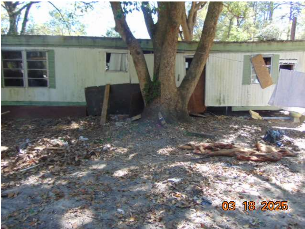
IMAGE DESCRIPTION 12:17 pm At 830 SE 159th Ter. Unsafe structure.