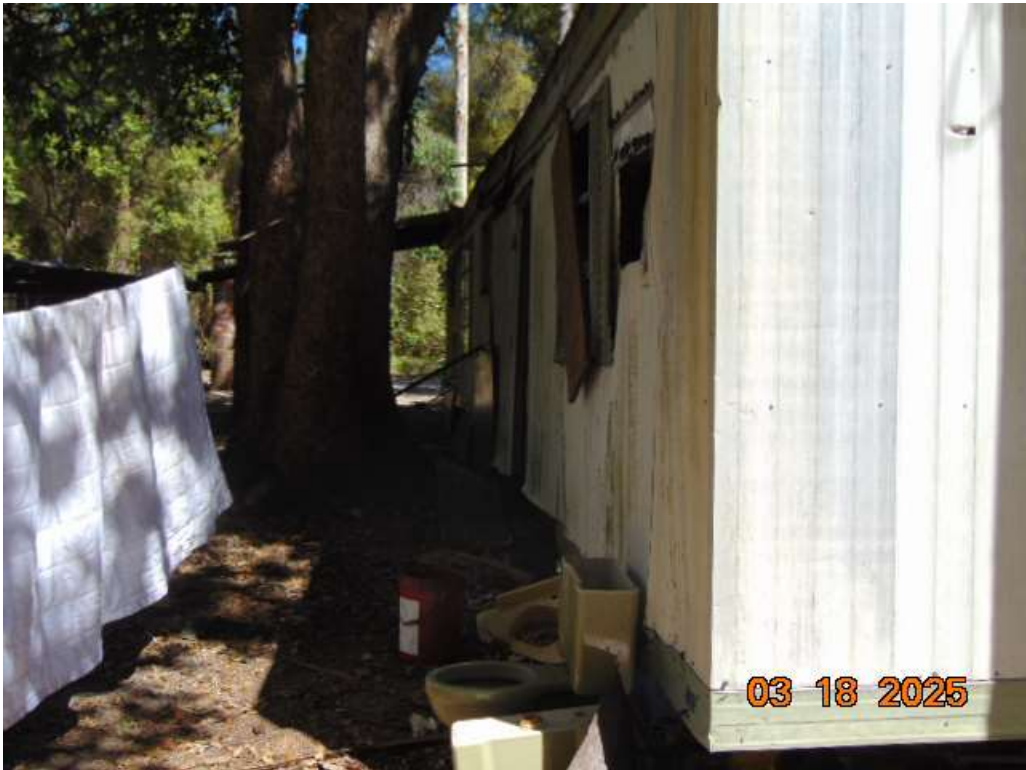
IMAGE DESCRIPTION 12:17 pm At 830 SE 159th Ter. Unsafe structure.