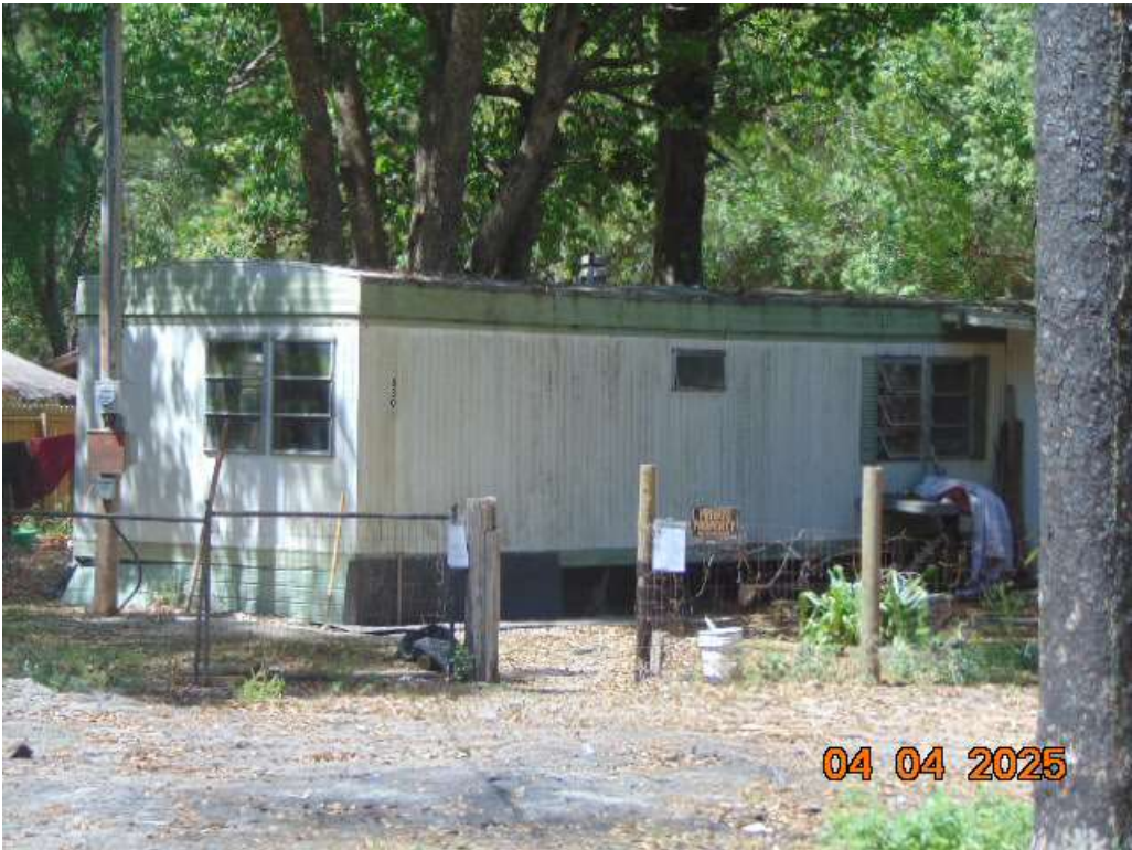
IMAGE DESCRIPTION 2:33 pm At 830 SE 159th Ter. Unsafe structure.