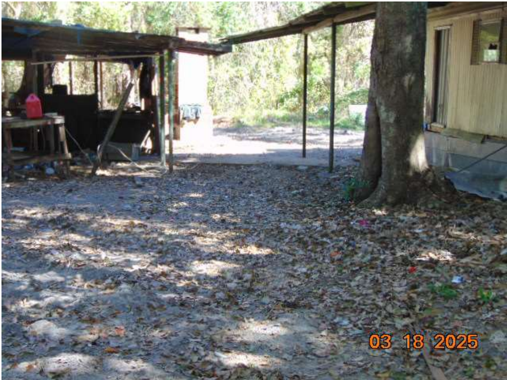
IMAGE DESCRIPTION 12:17 pm At 830 SE 159th Ter. Unsafe structure.