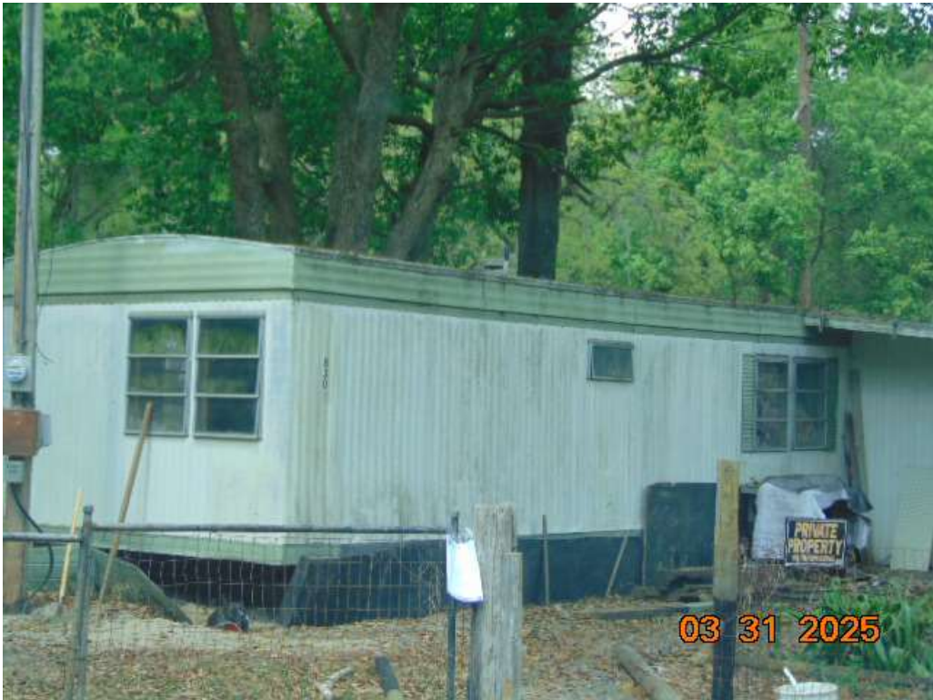
IMAGE DESCRIPTION 1:09 pm At 830 SE 159th Ter. Unsafe structure.