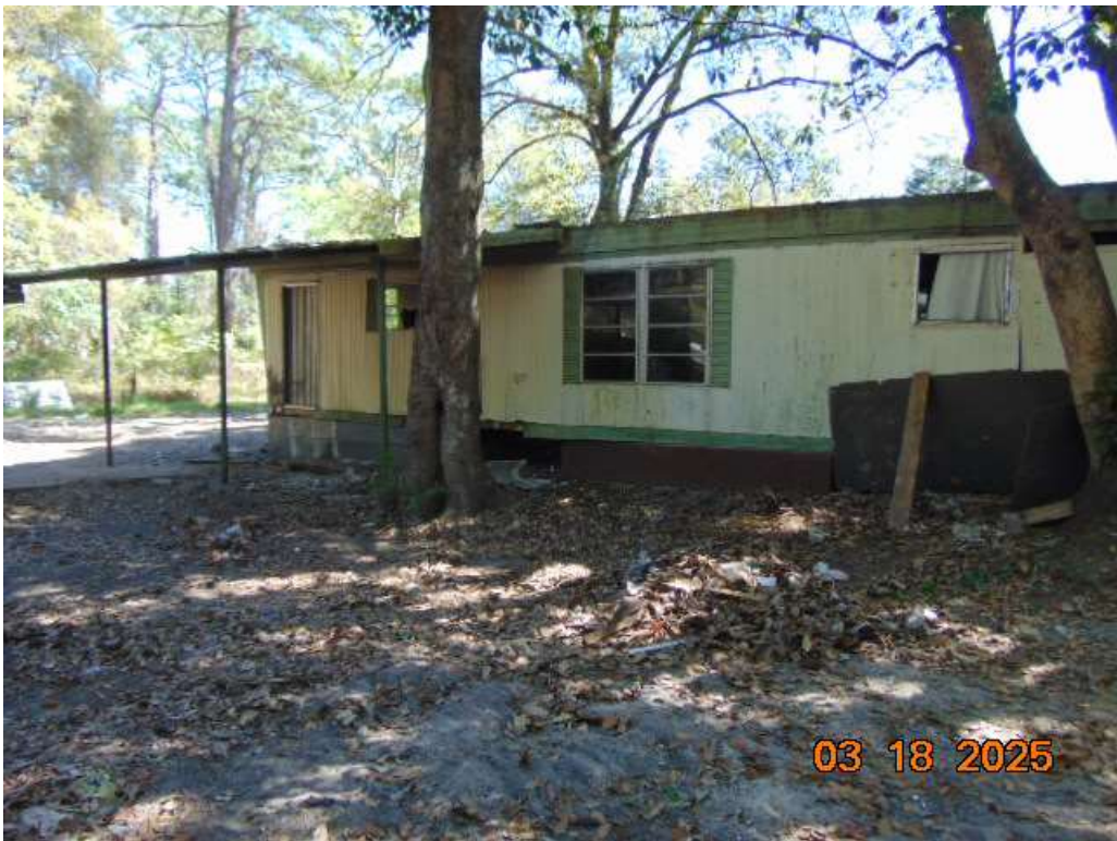
IMAGE DESCRIPTION 12:17 pm At 830 SE 159th Ter. Unsafe structure.