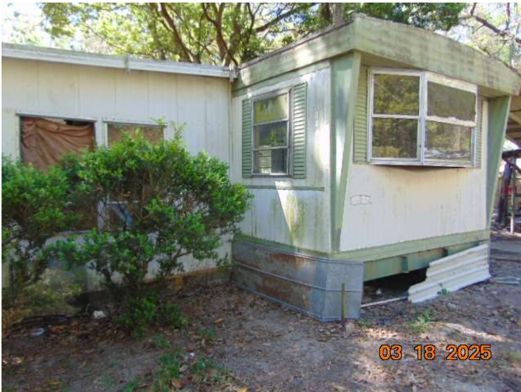
IMAGE DESCRIPTION 12:17 pm At 830 SE 159th Ter. Unsafe structure.