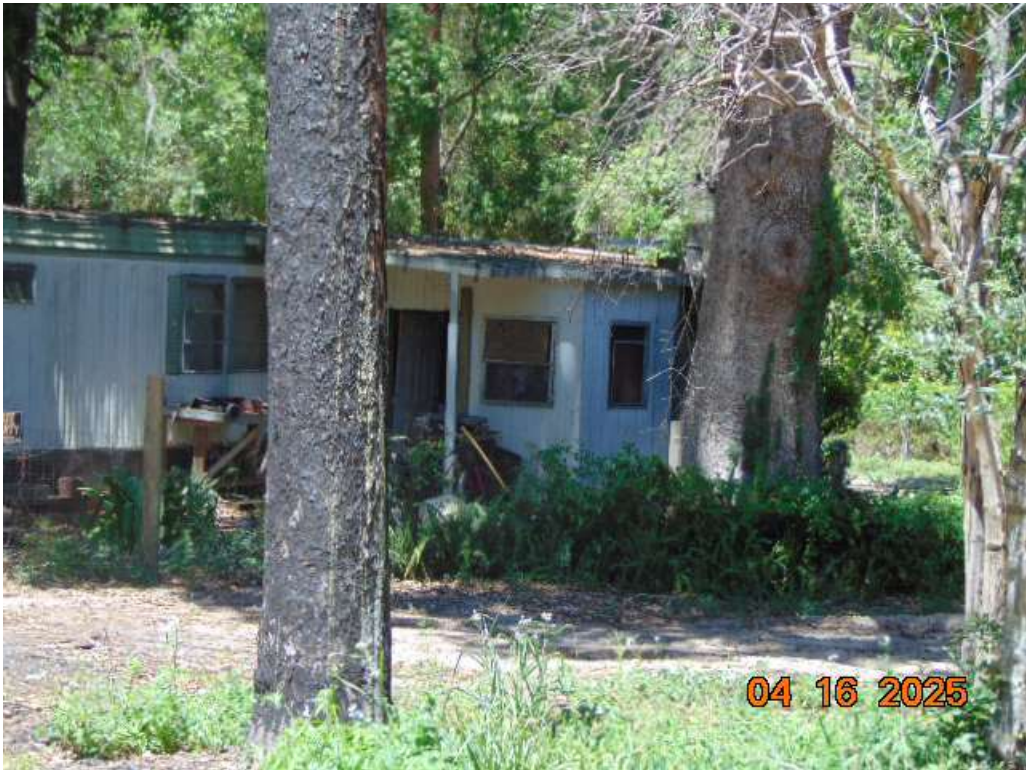
IMAGE DESCRIPTION 1:35 pm At 830 SE 159th Ter. Unsafe structure.