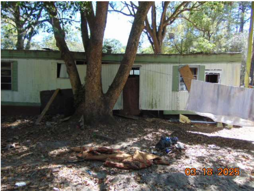
IMAGE DESCRIPTION 12:17 pm At 830 SE 159th Ter. Unsafe structure.