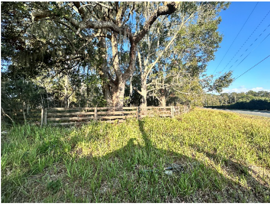
Existing site (undeveloped)