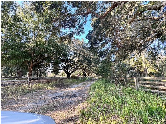
Existing site (undeveloped)