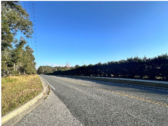
SW 80 th St – 2-lane paved roadway and buffer across the road (single family residential PUD)