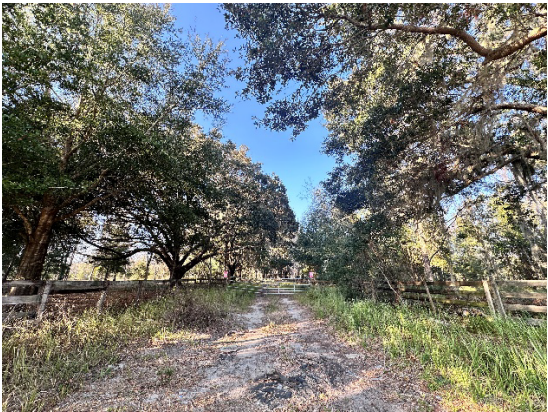
Existing site (undeveloped)