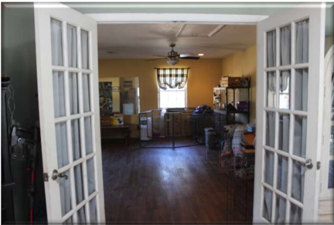
Grooming Area - Proposed