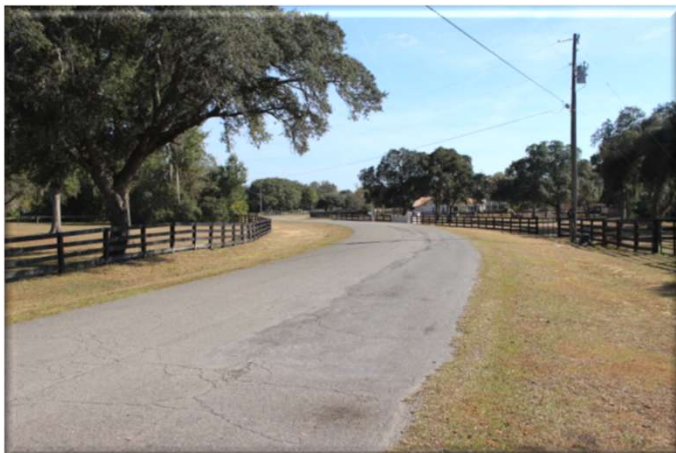
South on 52nd Court