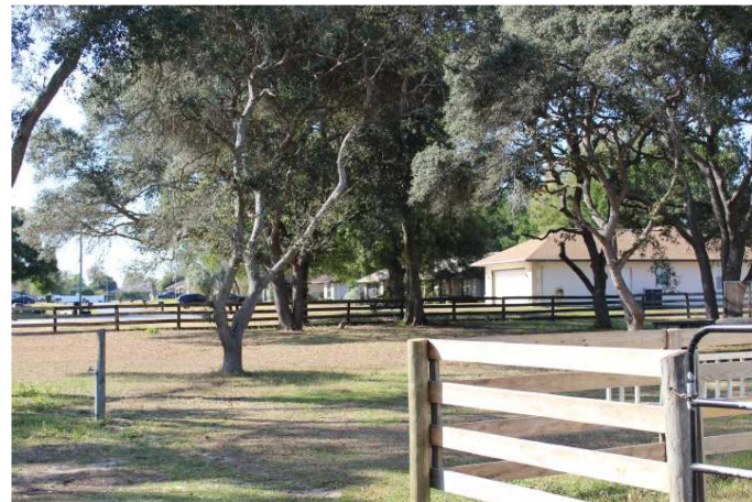
South of Subject Parcel