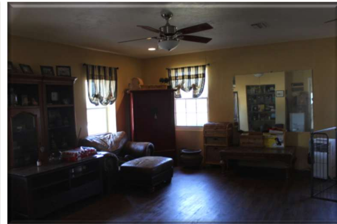
Grooming Area - Proposed