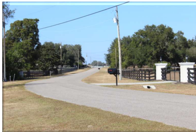
South on 52nd Court