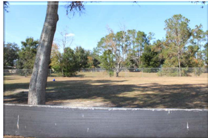
North of Subject Parcel