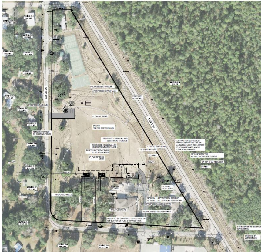
Figure 5A Treatment Site Plan