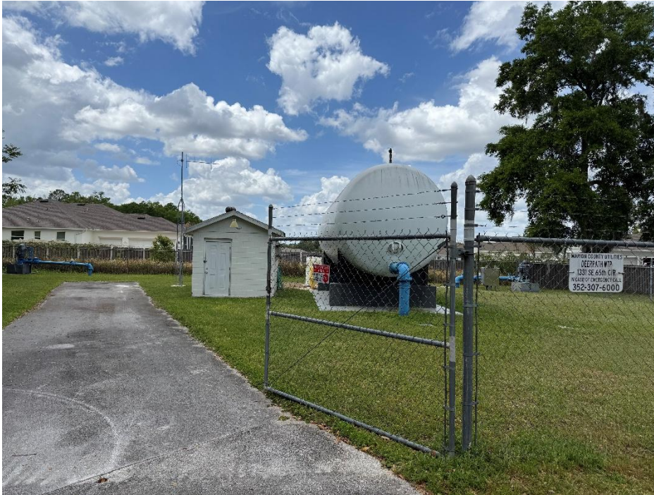
Figure 6 Marion County Water Treatment Plant in Deerpath