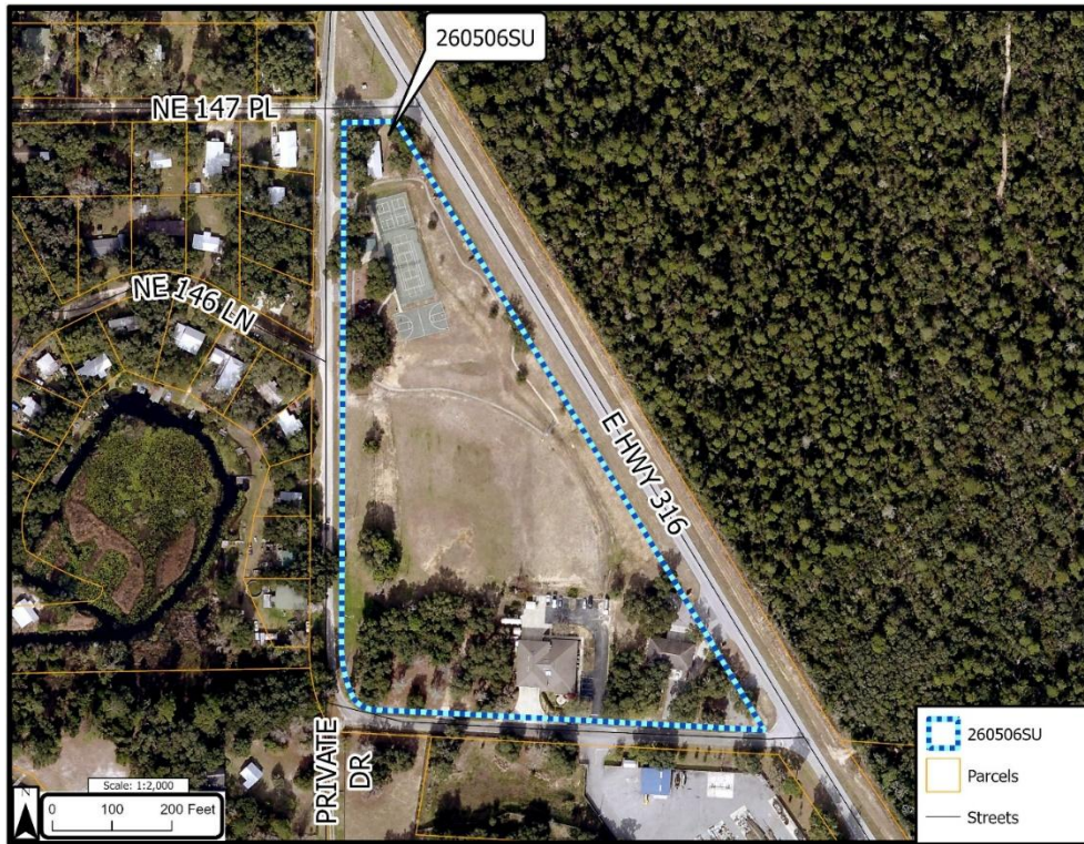
Figure 1 Aerial Photograph of Subject Property