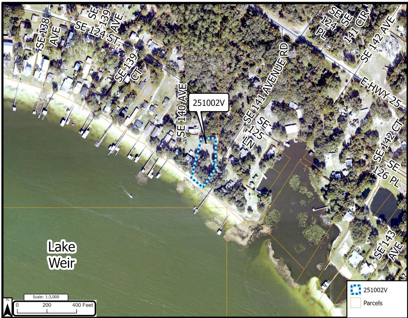
FIGURE 1 General Location Map