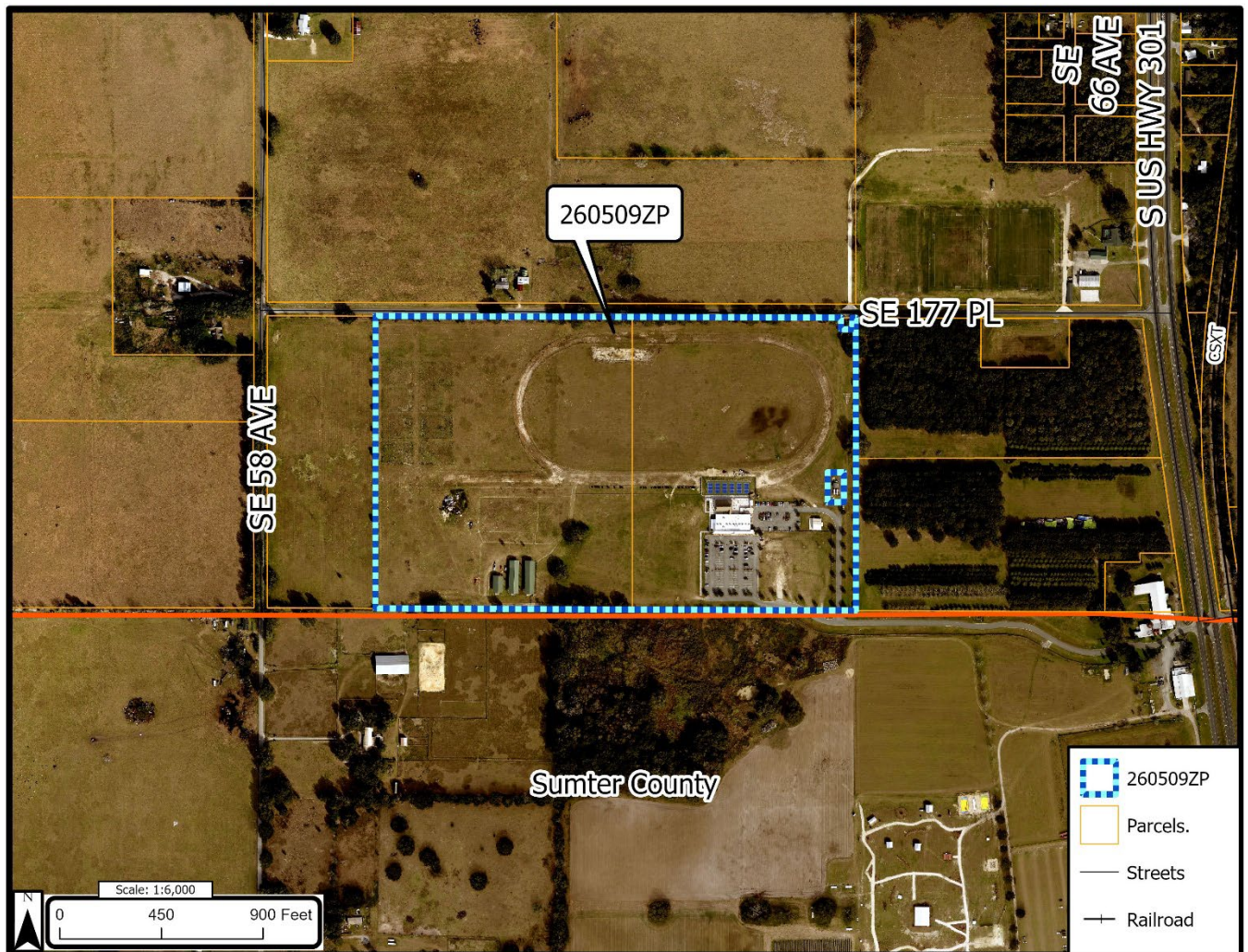
Figure 1 – Aerial Location Map

Tillman and Associates Engineering, LLC, on behalf of the owner Marion Gaming Management, LLC, filed a PUD amendment to request modifications of the approved PUD concept plan (see Attachment A). The amendment includes 1) to allow six pickleball courts and two manufactured buildings (built without permit); 2) modify buffers; 3) modify construction access; and 4) and 3) other requests such as expanding allowable uses to B-2 uses, DRA modification, and site plan layout as submitted Master Plan. Proposed PUD Master Plan is provided as shown below (Figure 2 and Attachment B). The Parcel Identification Numbers for the property are 48476-001-00 and 48476-002-00. The subject property sits in Commercial (COM) land use designation. The site is located outside of the Urban Growth Boundary and within the Secondary Springs Protection Zone and Flood Prone Areas. There are several code violation cases for the construction without permit and non-conforming uses including pickleball courts and manufactured buildings that were built and operating on site without approved PUD and building permits.