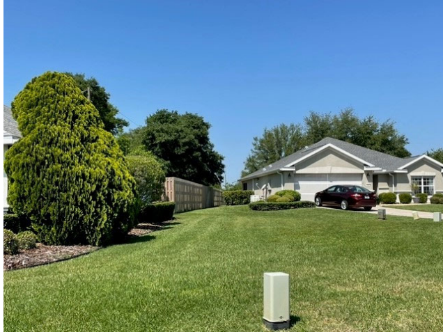
East end of 8' opaque privacy along shared north boundary.