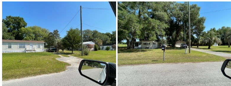
Residence where Spruce Creek Country Club begins; 8' opaque privacy fence is visible behind residence.