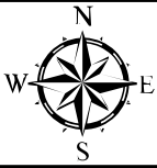
Exhibit "B" Heathbrook I, LLC & Heathbrook II, LLC