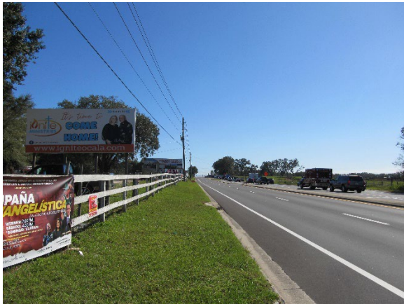
HWY 484 looking east