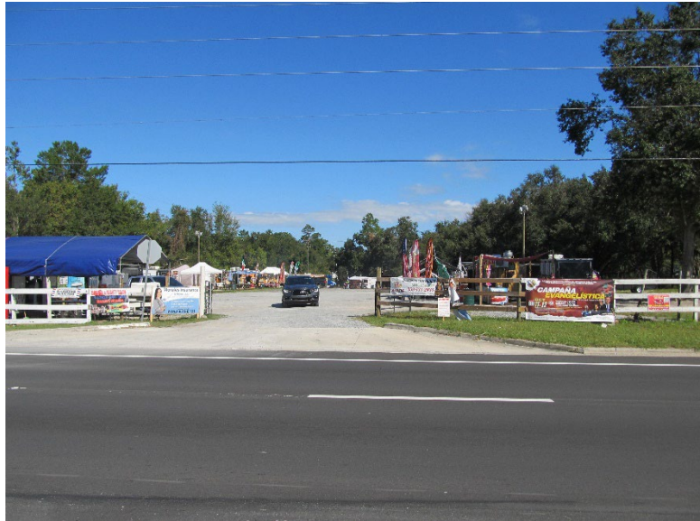
Entrance of the site.