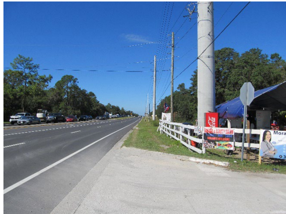
HWY 484 looking west