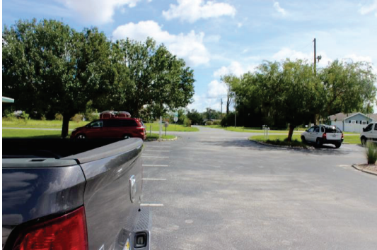
Entry from Pecan Rd. (Proposed)