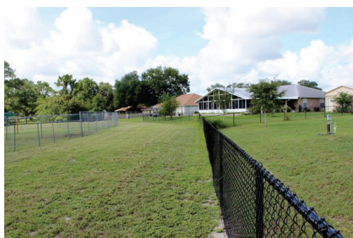
Western fence line to be buffered with fence/hedgerow