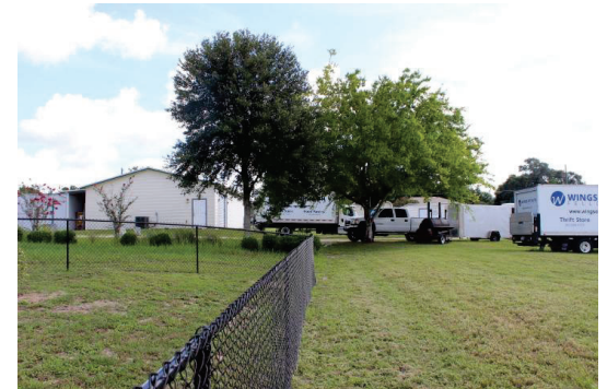
Existing Food Pantry