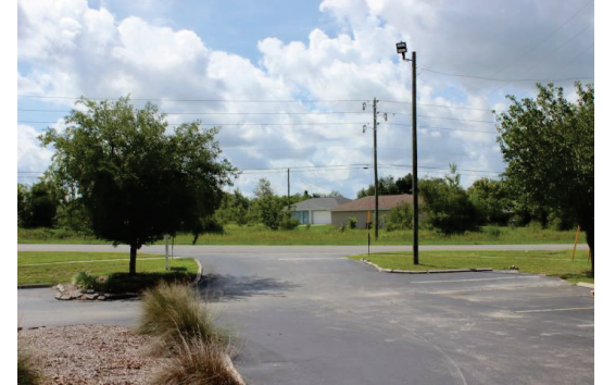
Exit to SE 64 th Ave. Rd. (Proposed)