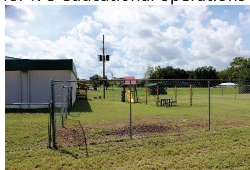
Playground to be upgraded for K-5 use