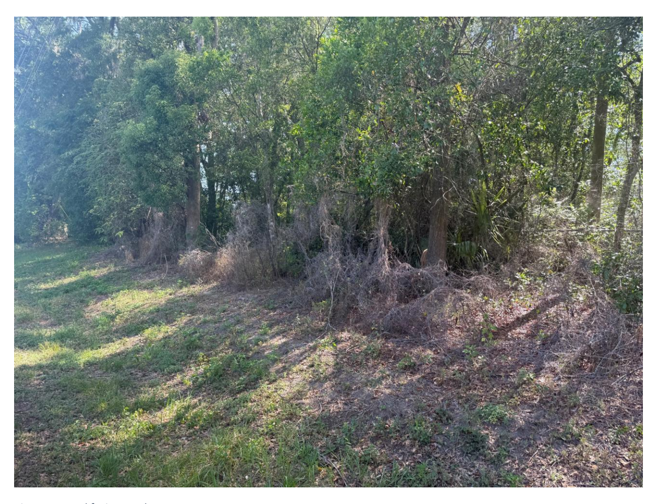
Figure 7 Parcel facing south