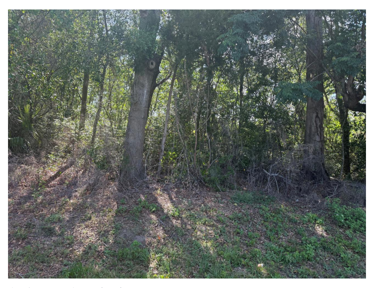
Figure 8 Dense vegetation around parcel