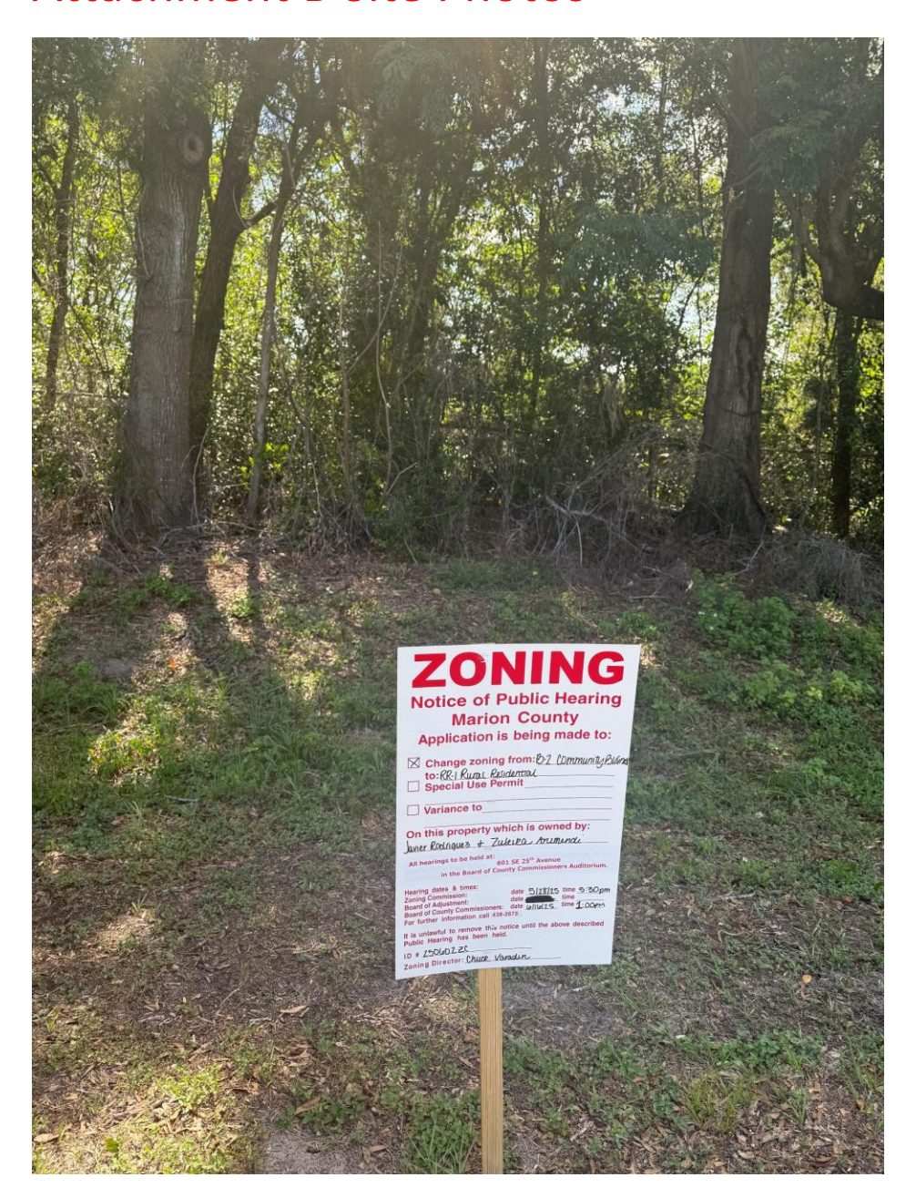
Figure 10 Sign Posting