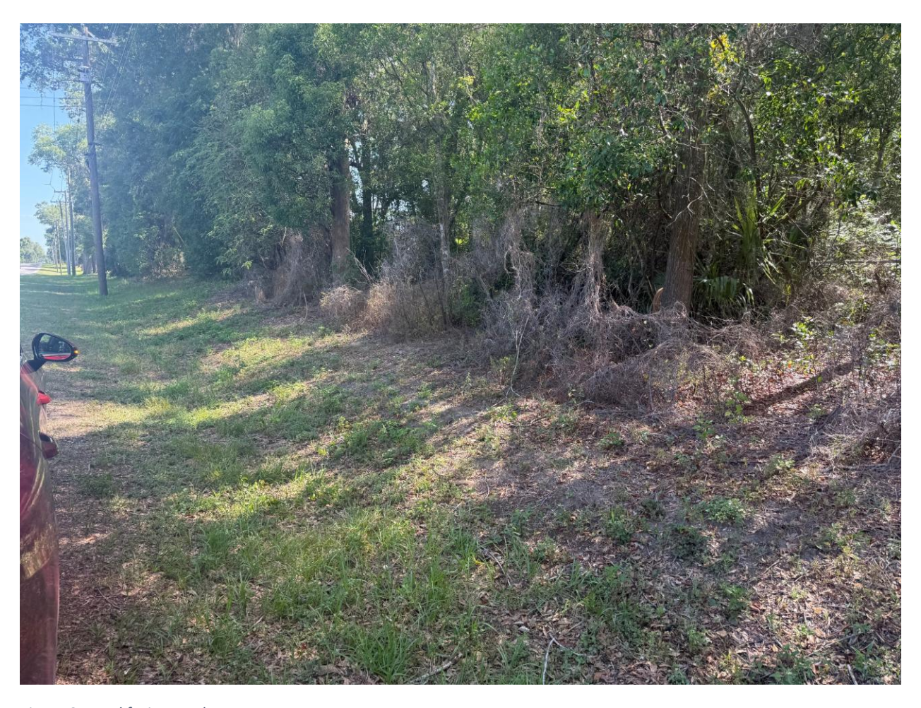
Figure 6 Parcel facing south