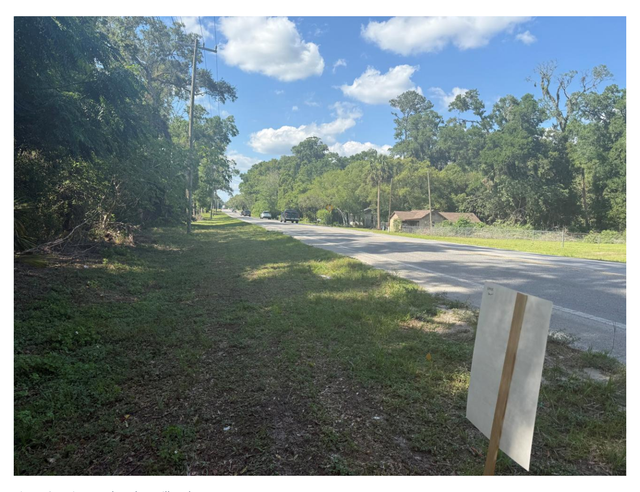
Figure 3 Facing North Jacksonville Rd.