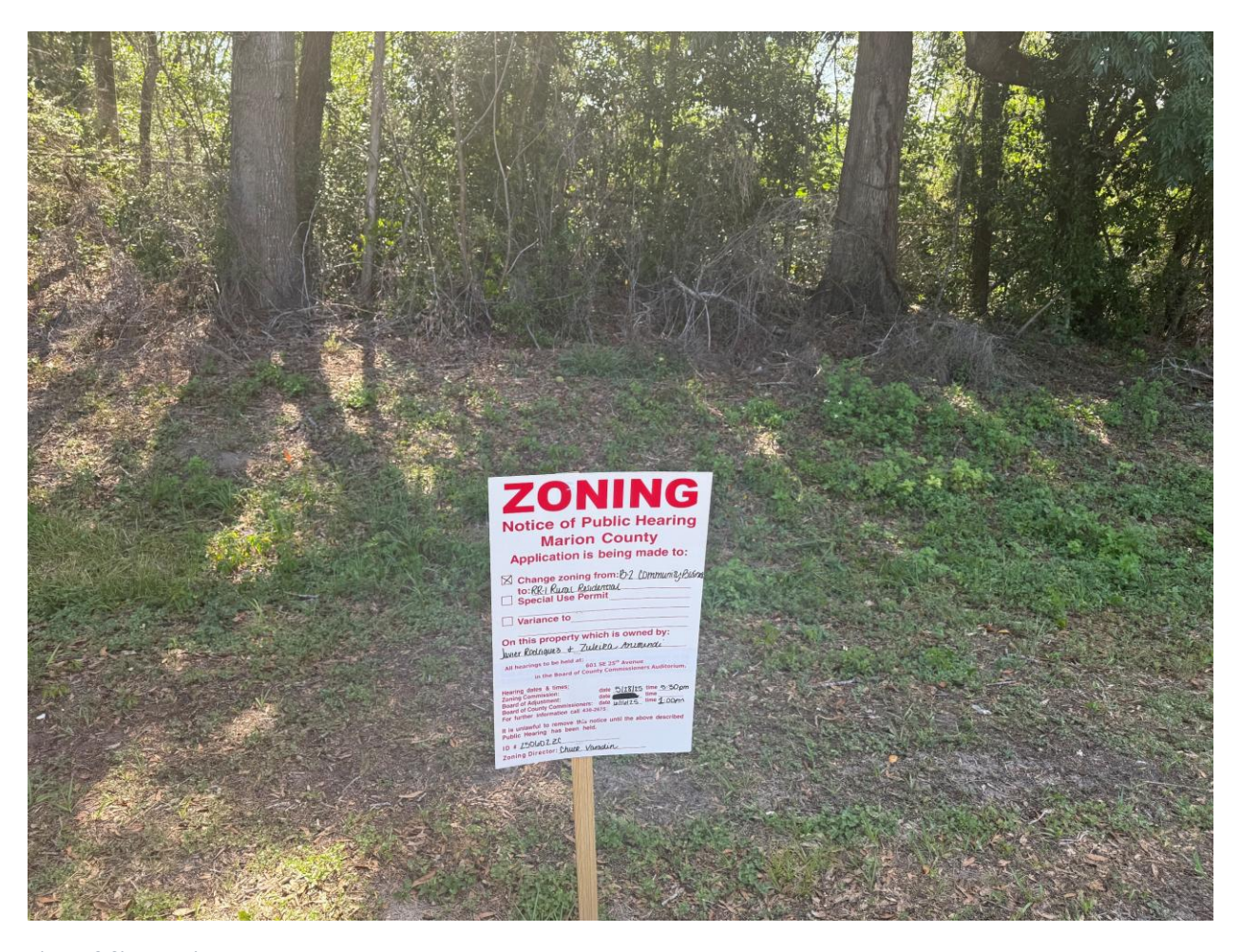
Figure 9 Sign Posting