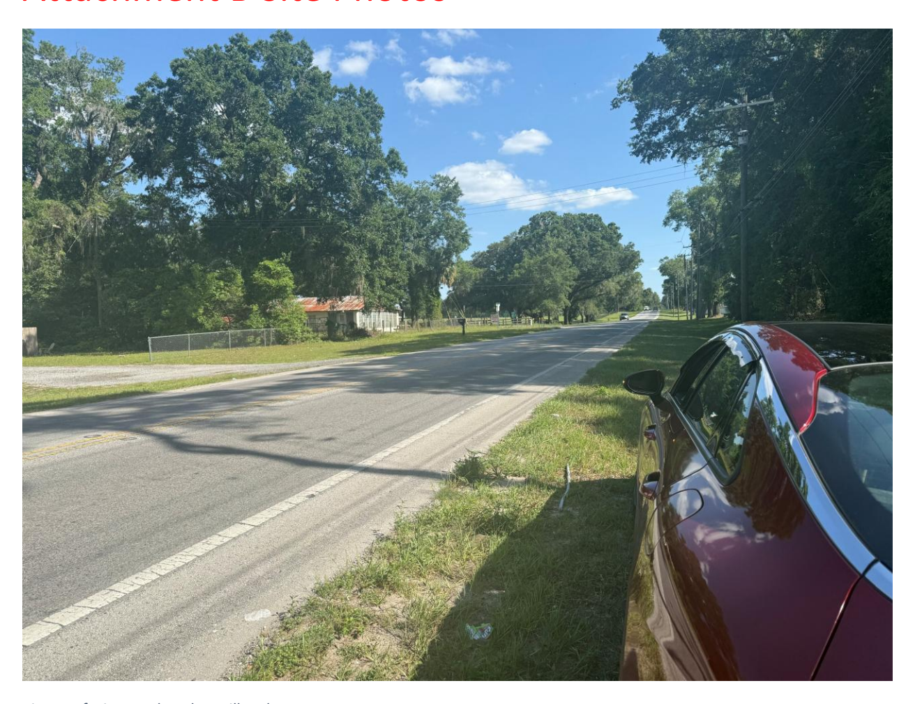
Figure 4 facing south Jacksonville Rd.