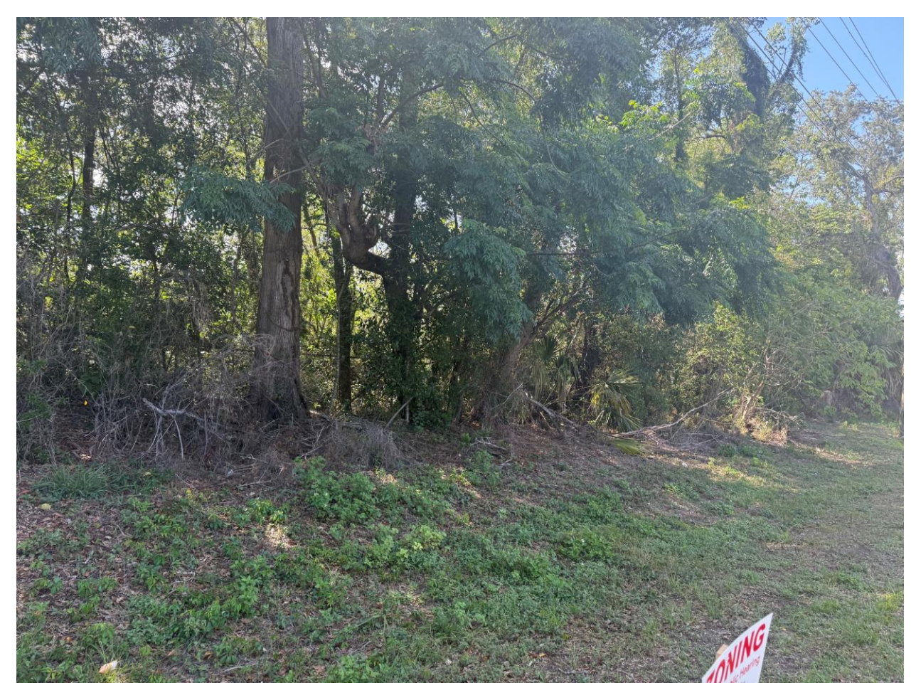
Figure 5 Parcel facing north