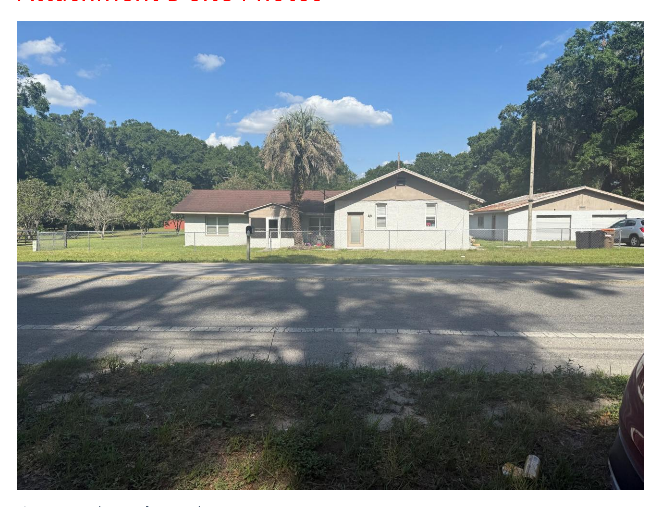
Figure 1 Across the street from parcel