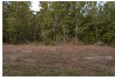
Figure 2 Subject parcel