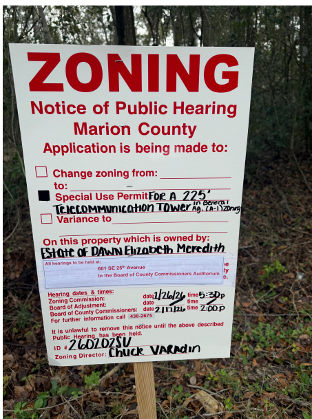
Figure 10 Proof of sign posting