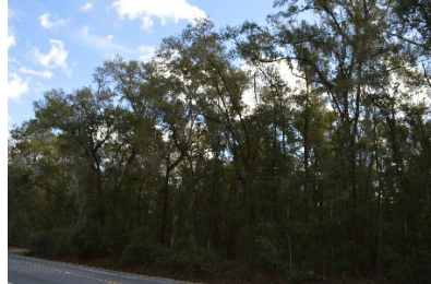
Figure 5 Subject parcel showing heavy vegetation