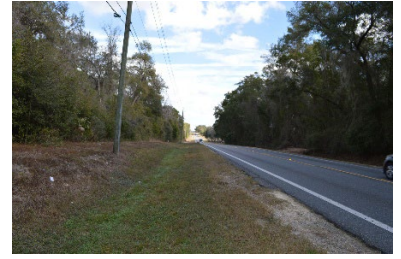
Figure 3 facing northeast onto HWY 40