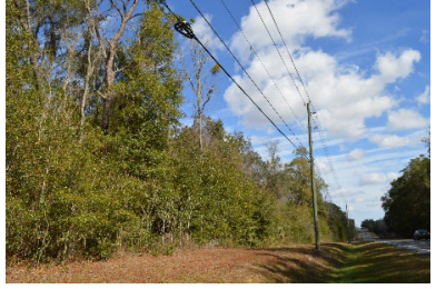
Figure 9 Northwest parcel across ROW from subject parcel