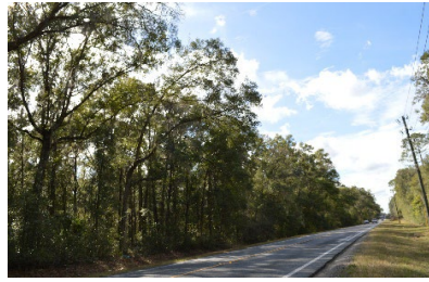
Figure 8 Facing southwest onto HWY 40 towards subject property