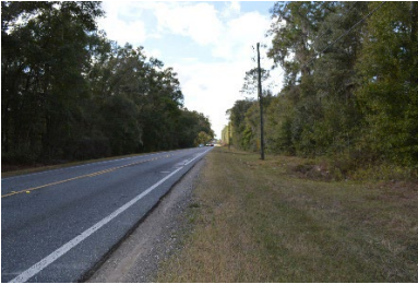
Figure 4 Facing southwest onto HWY 40