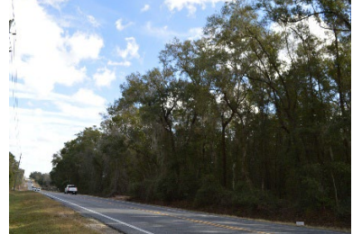
Figure 6 Facing northeast onto subject property