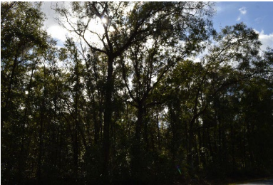
Figure 7 Subject parcel showing heavy vegetation