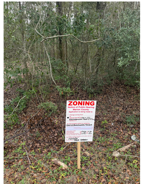
Figure 11 Proof of sign posting