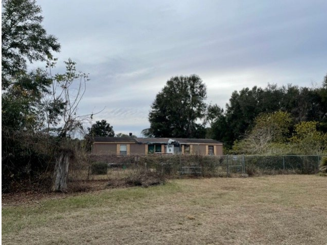
51. 1840 SW 130 th Street Road residence.