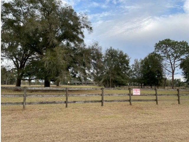
53. East/southeast from to site from residence.