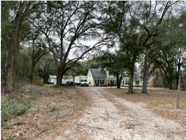
49. 1830 SW 130 th Street Road residence.