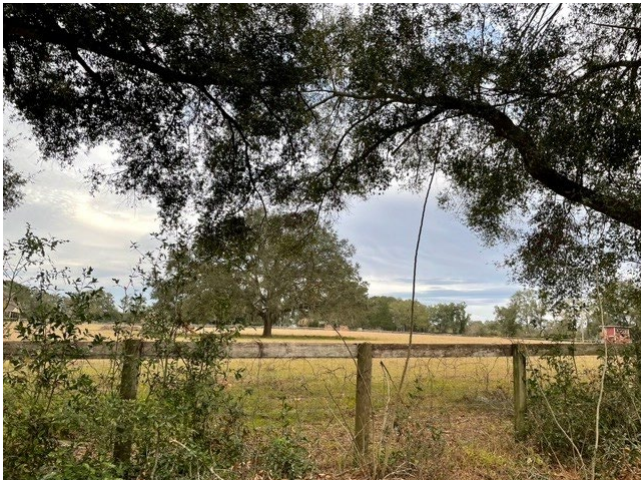
51. East view to site from residence.