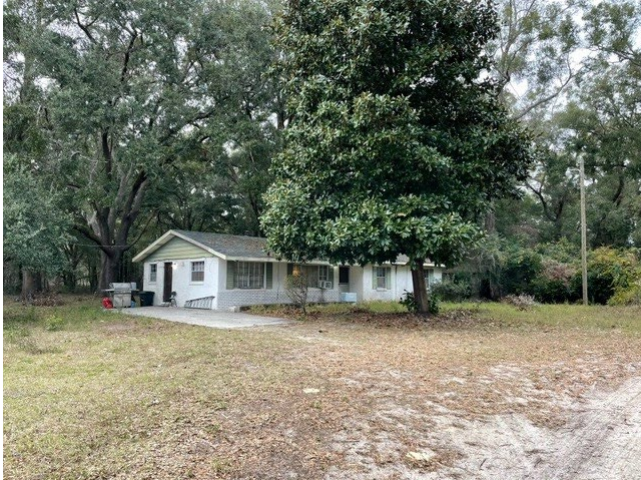
47. 1820 SW 130 th Street Road residence.