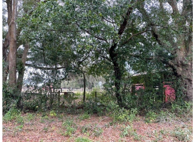
48. View to site from residence.