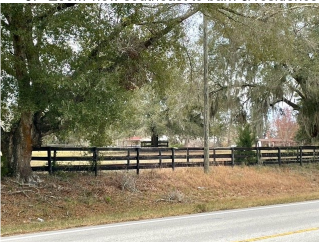
9. Zoom view southeast to barn & residence.