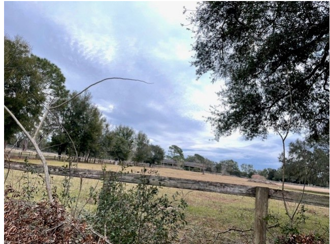
50. Northeast view to site from residence.