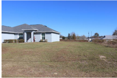
4. Facing north from parcel