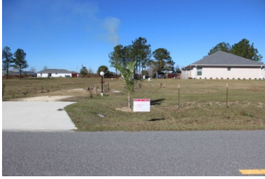
1. Side of house/driveway