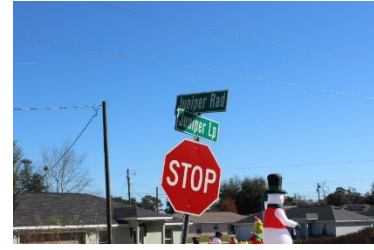
3. Corner of subject property