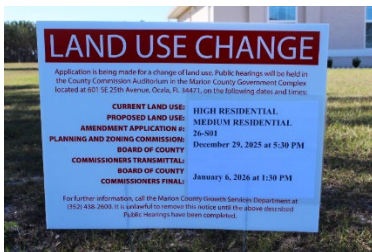
10. Proof of posting