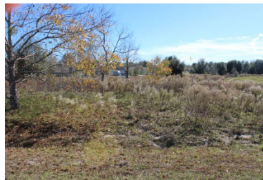
8. East from parcel