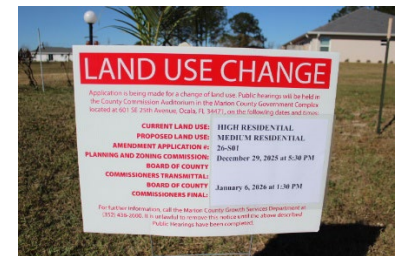
12. Proof of posting