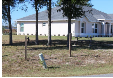
2. Corner looking onto subject property