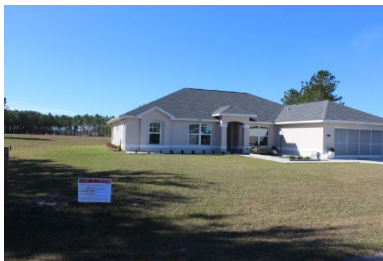
7. Subject Parcel