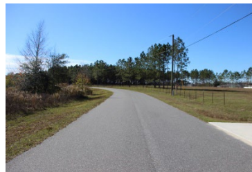
11. South from parcel