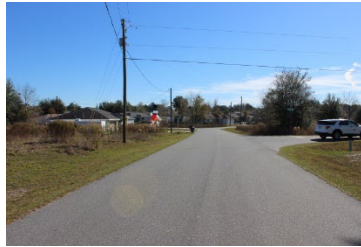
5. East from parcel