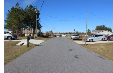
6. Northwest from parcel