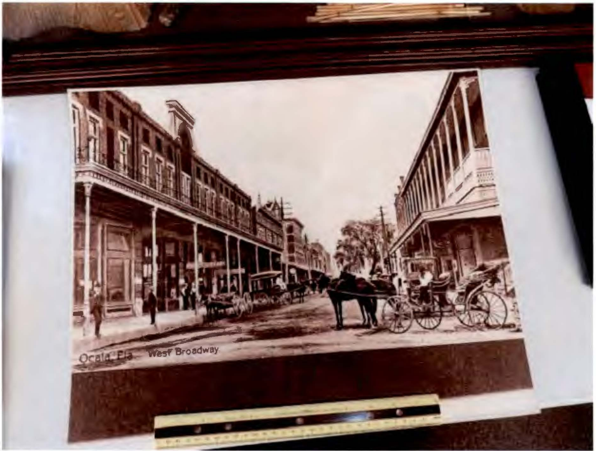
Ocala, Fla. West Broadway