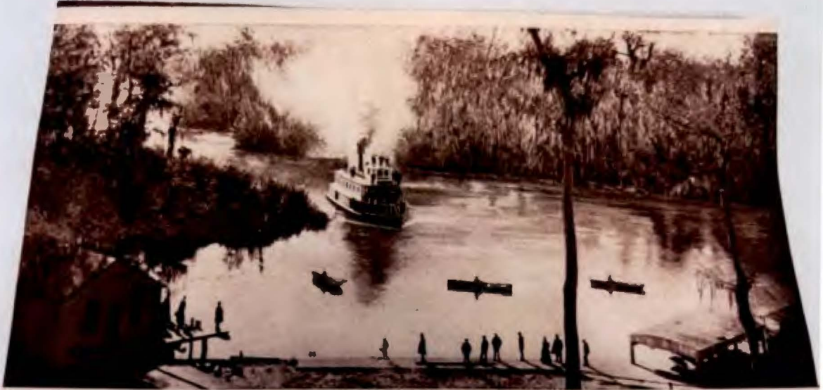
Silver Spring on the Ocklawaha River (Florida)