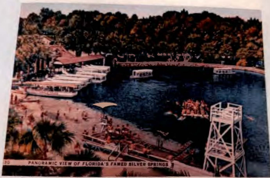
30 PANORAMIC VIEW OF FLORIDA'S FAMED SILVER SPRINGS