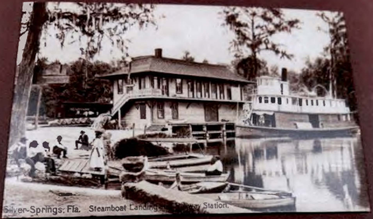
Silver-Springs: Fla. Steamboat Landing and Ferry Station.