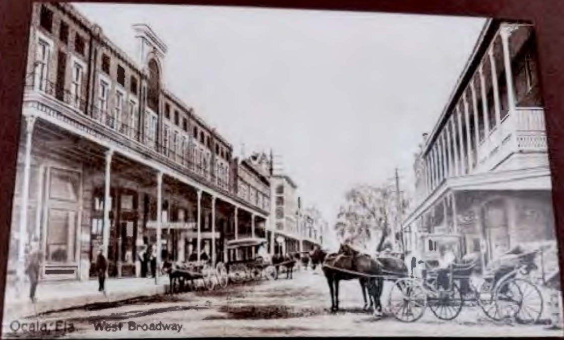
Ocala, Fla. West Broadway