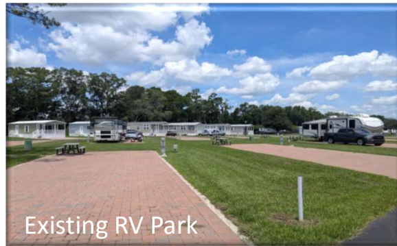
Existing RV Park