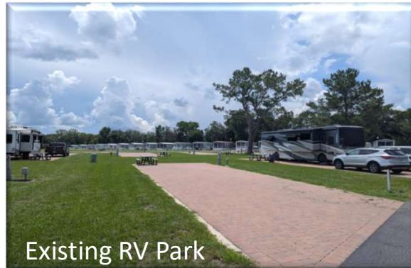
Existing RV Park