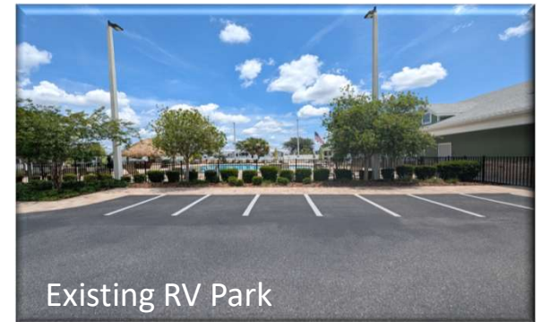
Existing RV Park