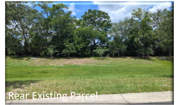
Rear Existing Parcel