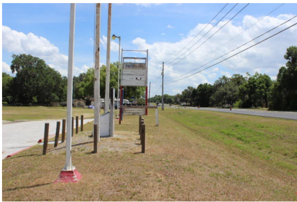
3. Southern boundary