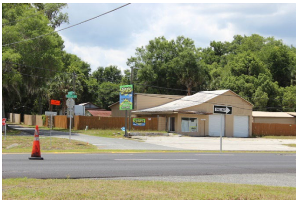
8. Dave's Auto adjacent to the west