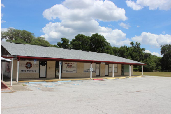
1. Front of the building