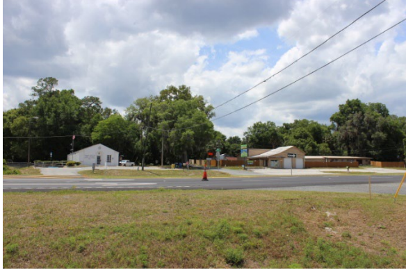
6. Adjacent parcels to the west