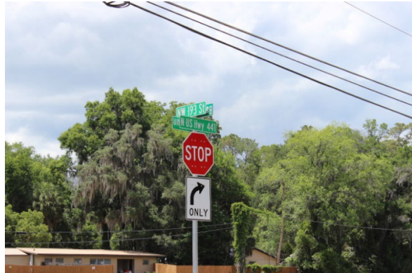
11. Parcel located on the corner of NW 193rd St. and N US HWY 441