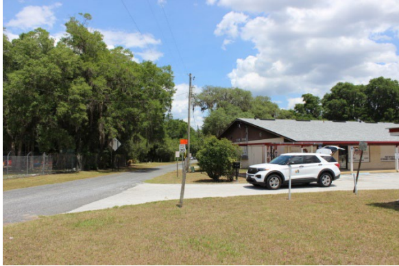
12. Northeast onto property and NW 193rd St.