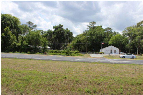
10. Facing south west adjacent properties