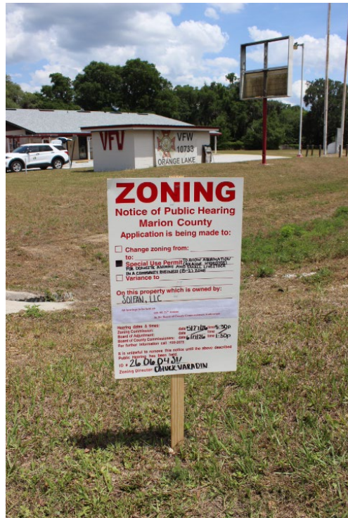
15. Proof of posting