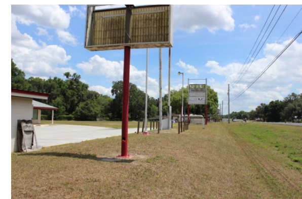
5. South onto N US HWY 441