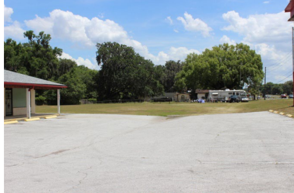
2. Facing south from parking lot