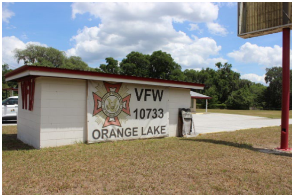
5. Storage on front of parcel