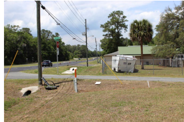
4. North onto N US HWY 441