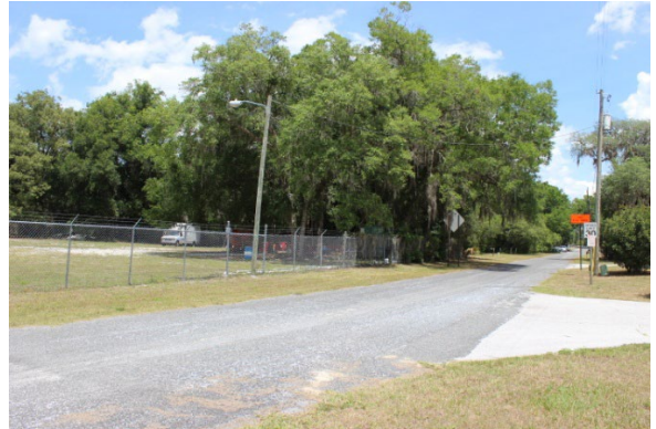
13. Ingress/Egress onto NW 193rd St.