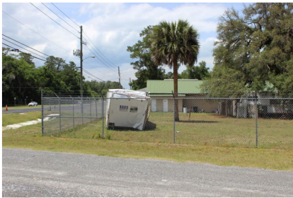
14. Adjacent property to the north