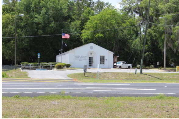
7. Post office adjacent to the west