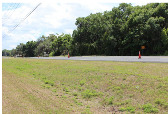
9. Facing adjacent properties to the southwest