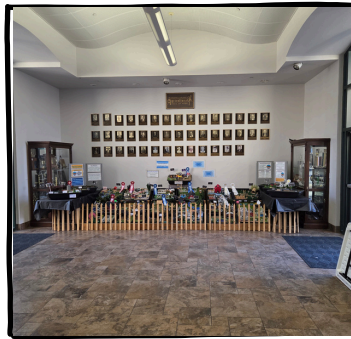
Conservation Landscape Tray