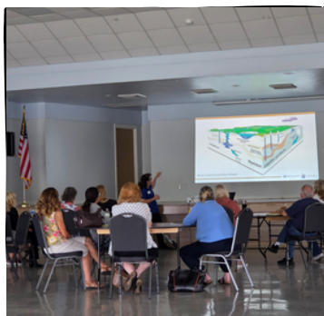
RLE Well Workshop