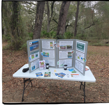
Springs Awareness Month