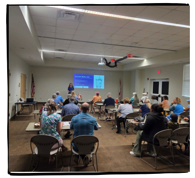
Bellevue Well Workshop