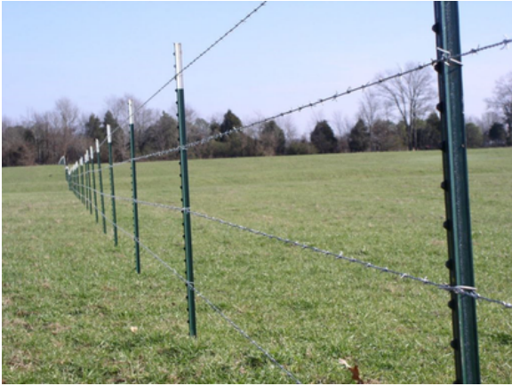
Cross Fencing to Subdivide Pastures