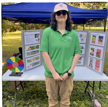
Buzz & Bloom