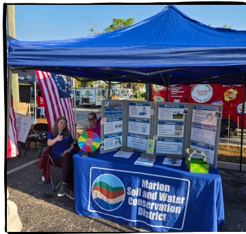
Marion County Day