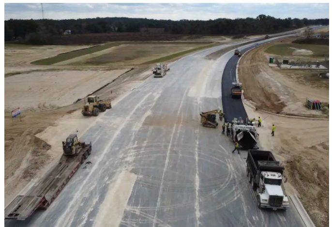
SW 40th/49th Ave Phase 1 – Construction south of Heath Brook Entrance