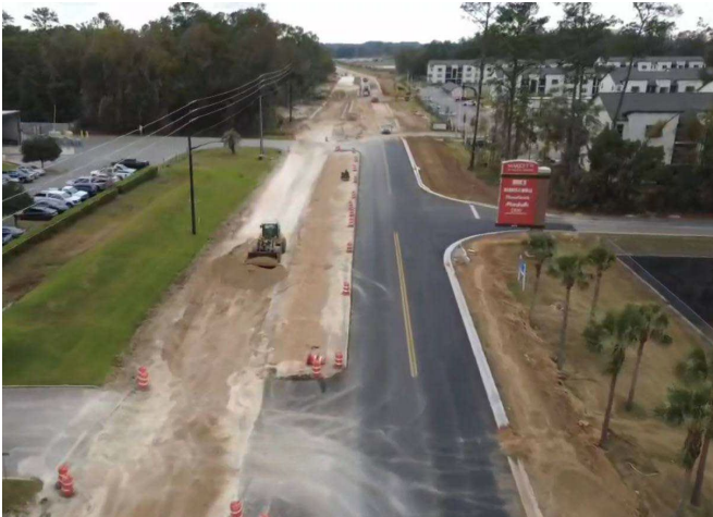
SW 40th/49th Ave Phase 1 – Construction at Heath Brook Entrance