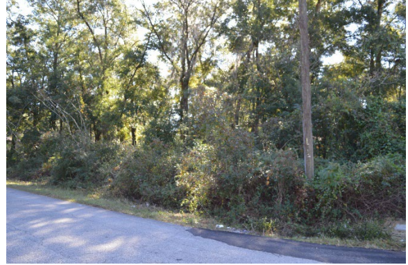
Fig. 8 parcel to the south east, across from subject parcel