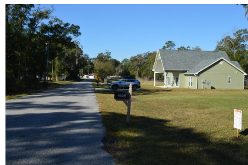
Fig. 6 Adjacent parcel to the west