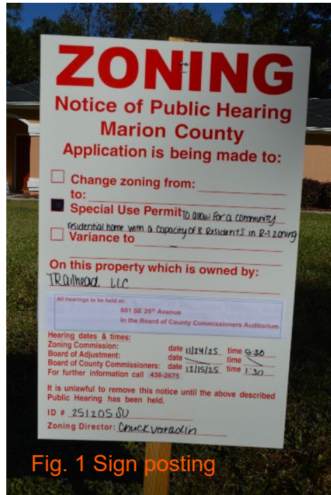
Fig. 1 Sign posting