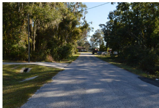
Fig. 4 Facing east from subject property