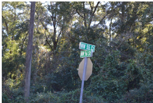
Fig. 3 intersection at location of site