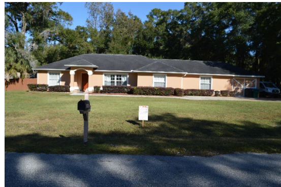
Fig. 2 Subject Property