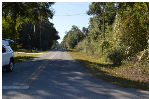
Fig. 5 Facing south from site