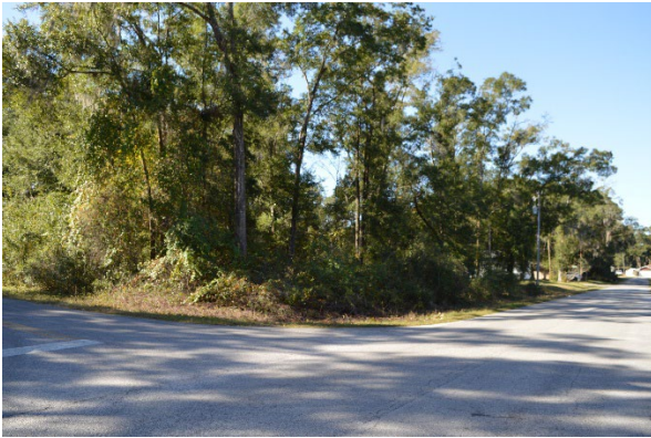
Fig. 9 parcel to the south west, across from subject property