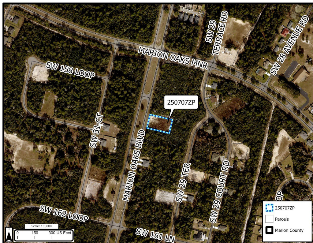
Figure 1 General Location Map

The subject parcel is located in Marion Oaks Unit 4 Multi-family Area. The application proposes rezoning the property from Multiple Family Dwelling (R-3) to Residential Planned Unit Development (R-PUD) to allow a maximum of eight multi-family units on the subject parcel consistent with the adjacent R-PUD parcels. The rezoning from R-3 to R-PUD conforms with the land use and is in compliance with the Comprehensive Plan.