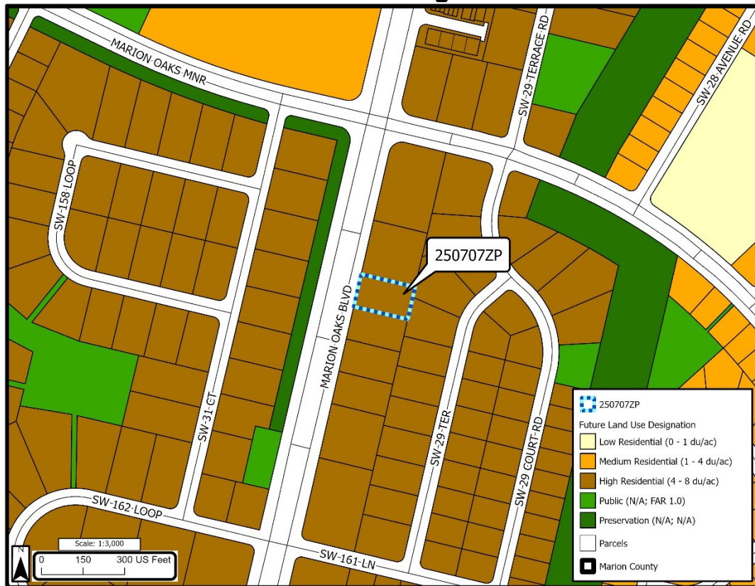
Figure 2 FLUMS Designation

Figure 3 displays the current zoning for the subject property in relation to the existing zonings of the surrounding properties. The majority of the surrounding properties are similarly zoned as R-PUD with a few R-3 parcels throughout. The site is located within the Secondary Springs Protection Zone (SSPZ). The multi-family residential use is consistent with the current High Residential land use designation and compatible with adjacent parcels.