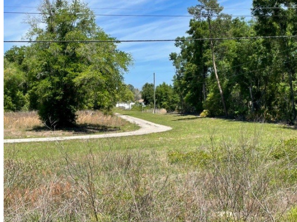
4. View of SW Hwy 484 and Marion Oaks Course intersection from south alley.