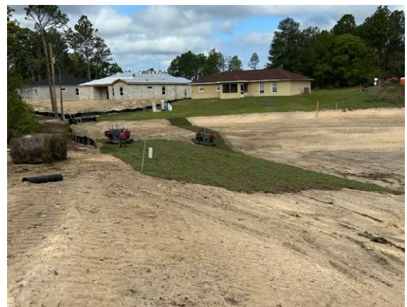
SW 49th Ave Seg F – Curb & Gutter and DRA Sod Installation