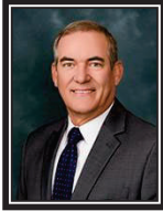
Sen. Stan McClain