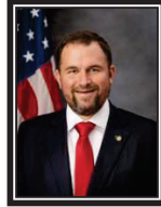
Rep. Judson Sapp