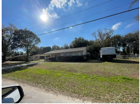
4. 5000 NE 18 th Court