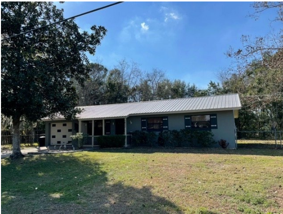
7. 5012 NE 18 th Court