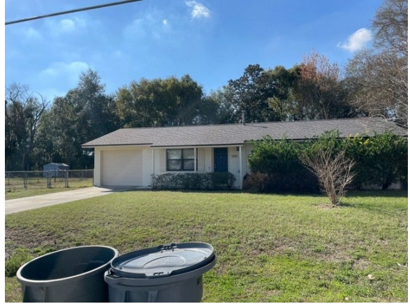
10. 5104 NE 18 th Court