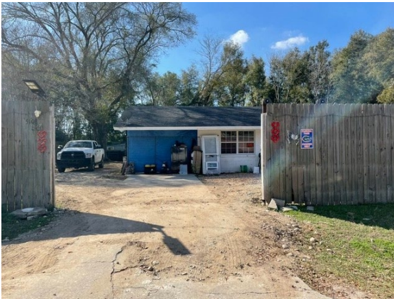
11. 5108 NE 18 th Court