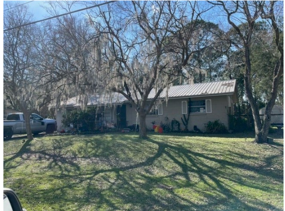
6. 5008 NE 18 th Court