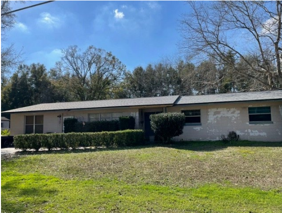
5. 5004 NE 18 th Court