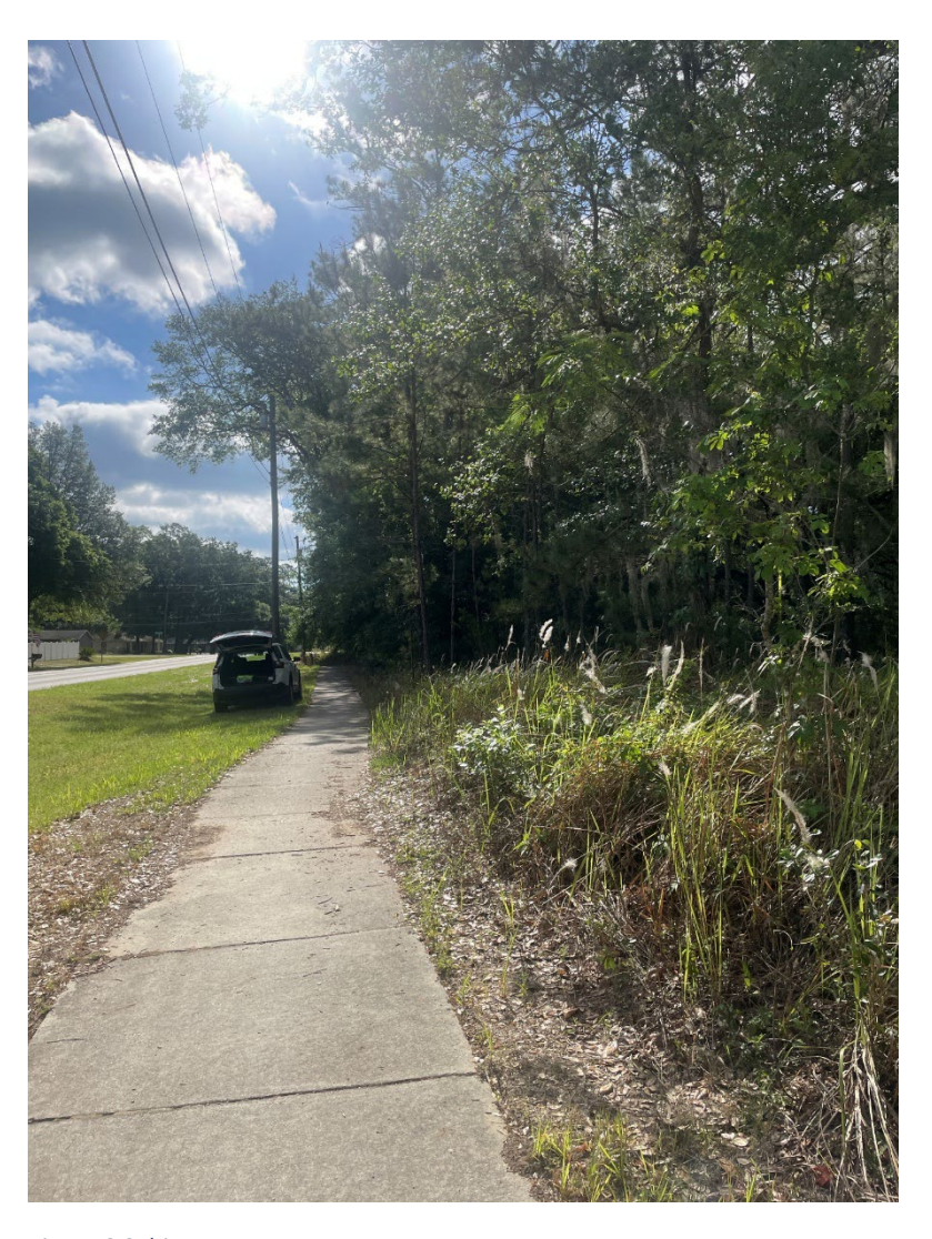
Figure 9 Subject property-East