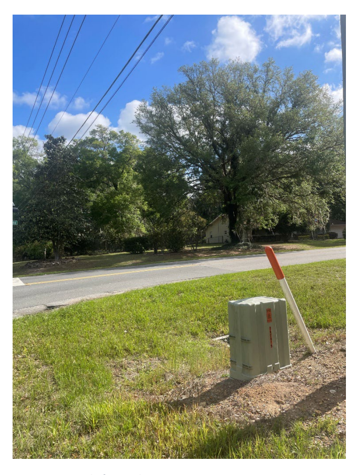
Figure 8 Pine Rd. from subject property