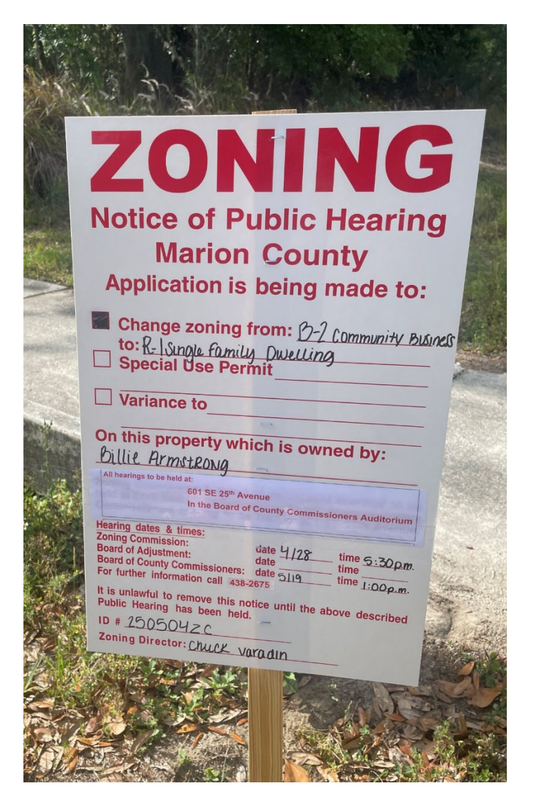
Figure 3 Sign Posting