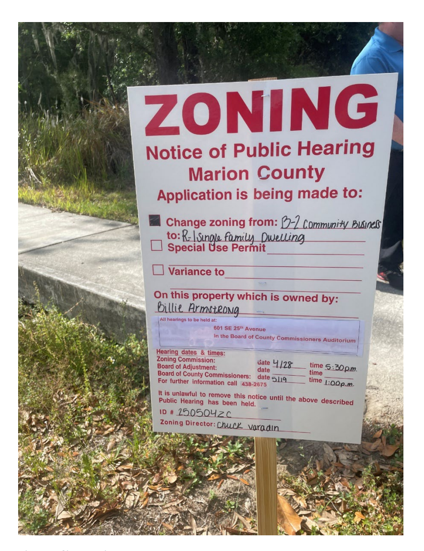
Figure 1 Sign Posting