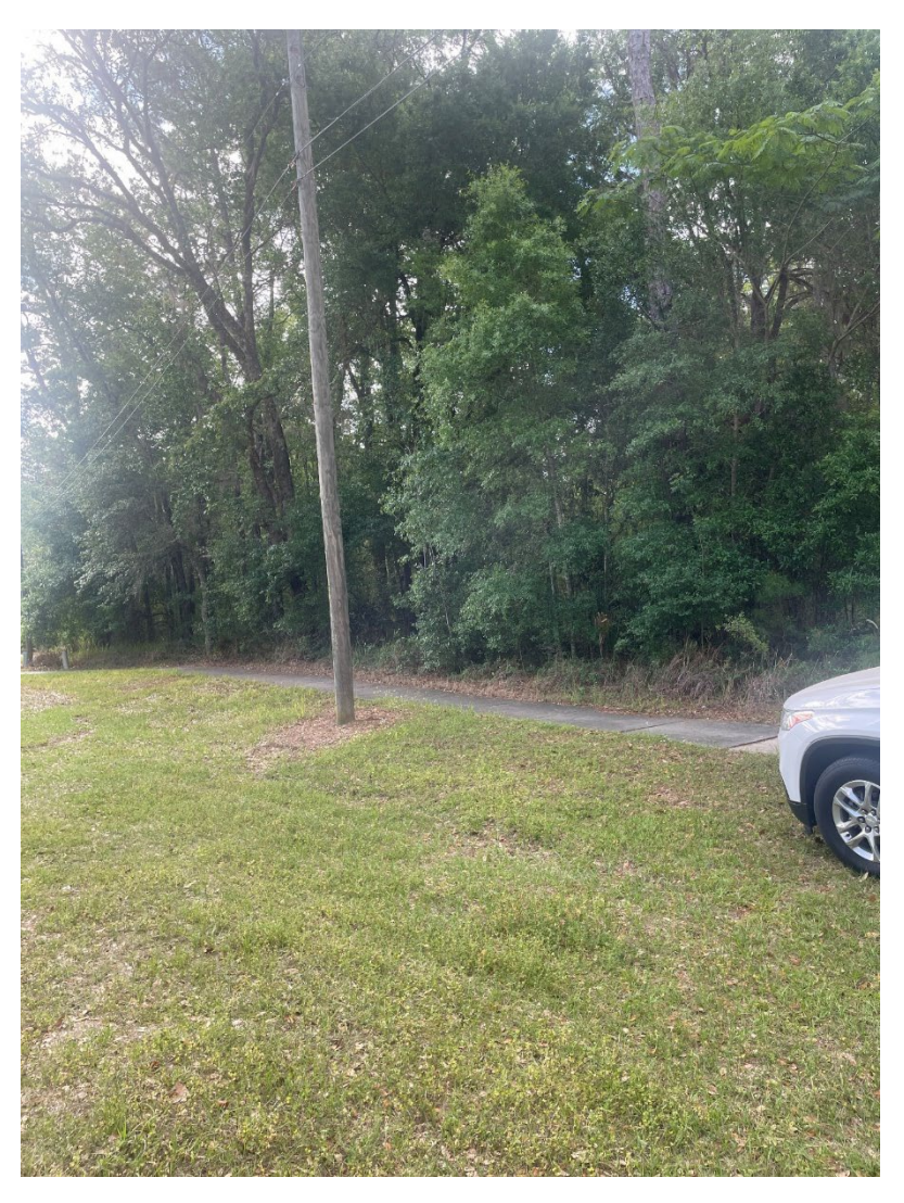
Figure 11 Subject property from Pine Rd.