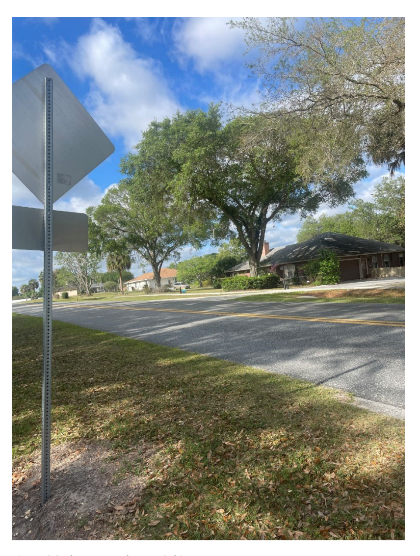
Figure 6 64th Avenue Rd. From Subject Property