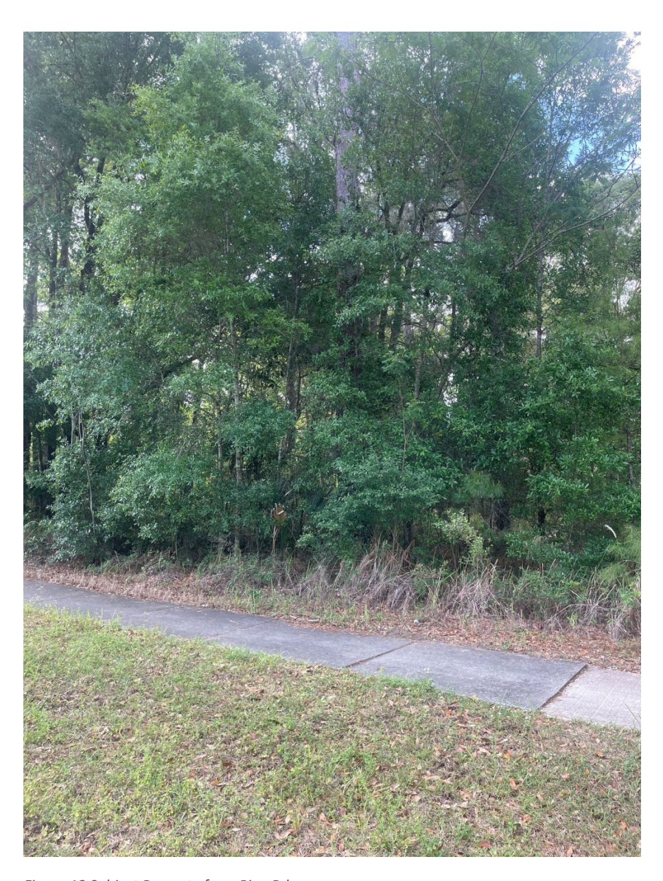
Figure 12 Subject Property from Pine Rd.