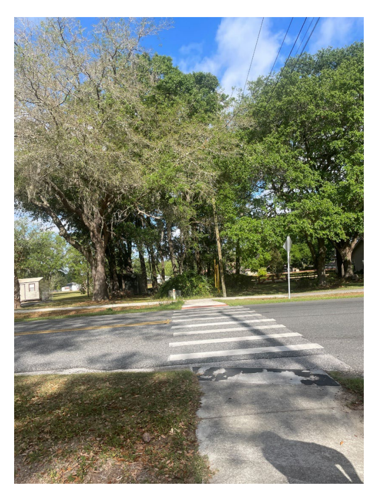
Figure 7 Intersection of Pine Rd. and SE 64th Avenye Rd