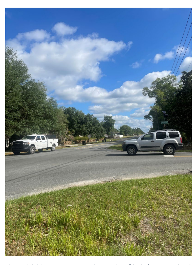
Figure 13 Subject property corner, intersection of SE 64th Avenue Rd and Pine Rd