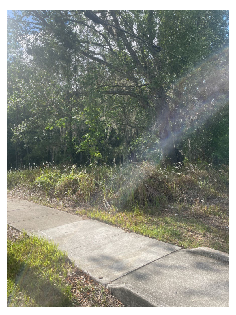
Figure 5 Subject Property