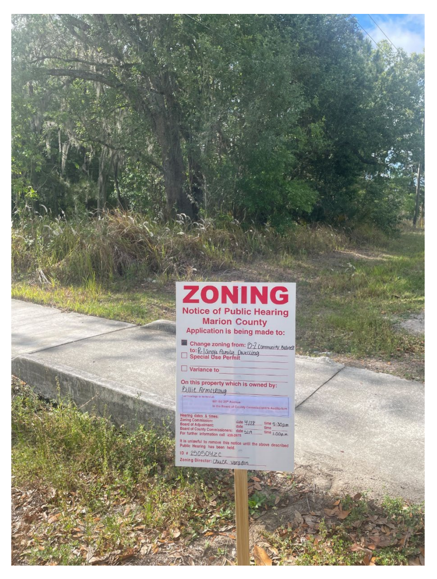
Figure 4 Sign Posting with subject property