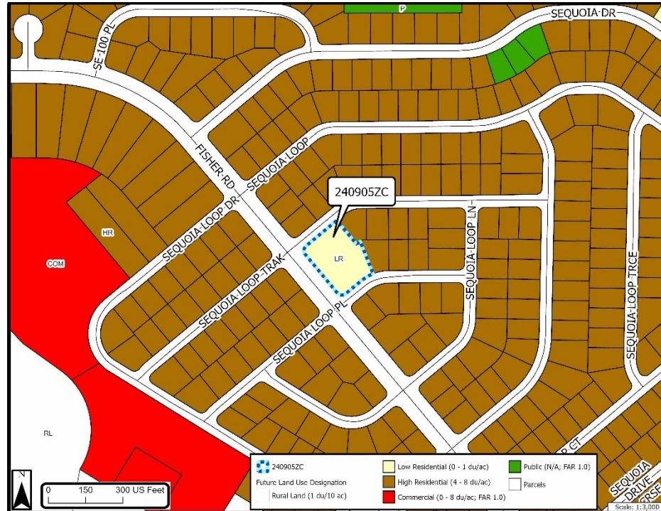
Figure 2 FLUMS Designation

The subject property's LR designation accommodates residential densities up to 1 dwelling unit per acre (1 DU/AC). The site's historic R-1 zoning classification identifies less than one-acre tracts as potentially possible that creates some confusion due to the site's LR designation. The requested R-E rezoning will eliminate the confusion and reflect the site's LR density, and enable limited animal uses (e.g., horses) subject to site design requirements, further consistent with the LR designation.