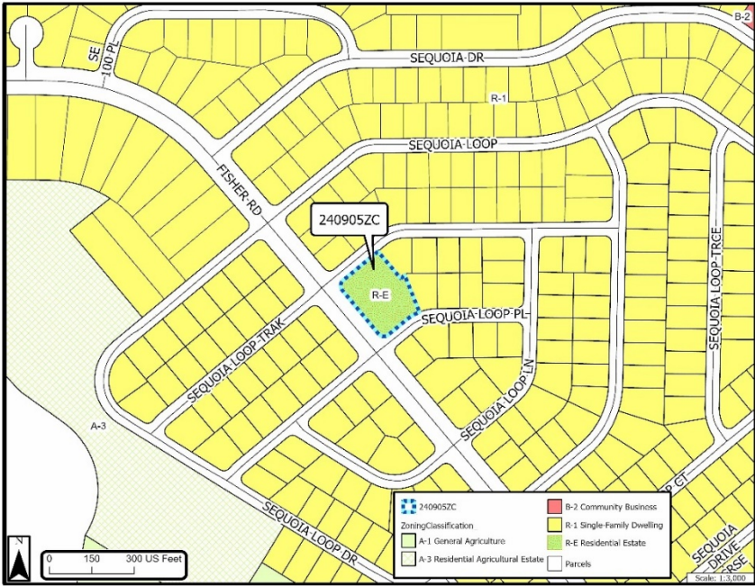
Figure 3 Proposed Zoning Classification

Figure 4 provides an aerial image of the subject property and surrounding area, while Figure 5 displays the subject and surrounding properties' existing uses as established by the Marion County Property Appraiser Office's Property Code (PC). Table A displays the information of Figures 2, 3, 4, and 5 in tabular form.