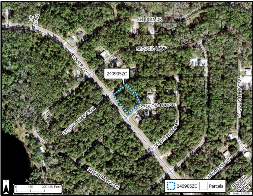
Figure 4 Surrounding Area Aerial

Figure 4 provides an aerial image of the subject property and surrounding area, while Figure 5 displays the subject and surrounding properties' existing uses as established by the Marion County Property Appraiser Office's Property Code (PC). Table A displays the information of Figures 2, 3, 4, and 5 in tabular form.